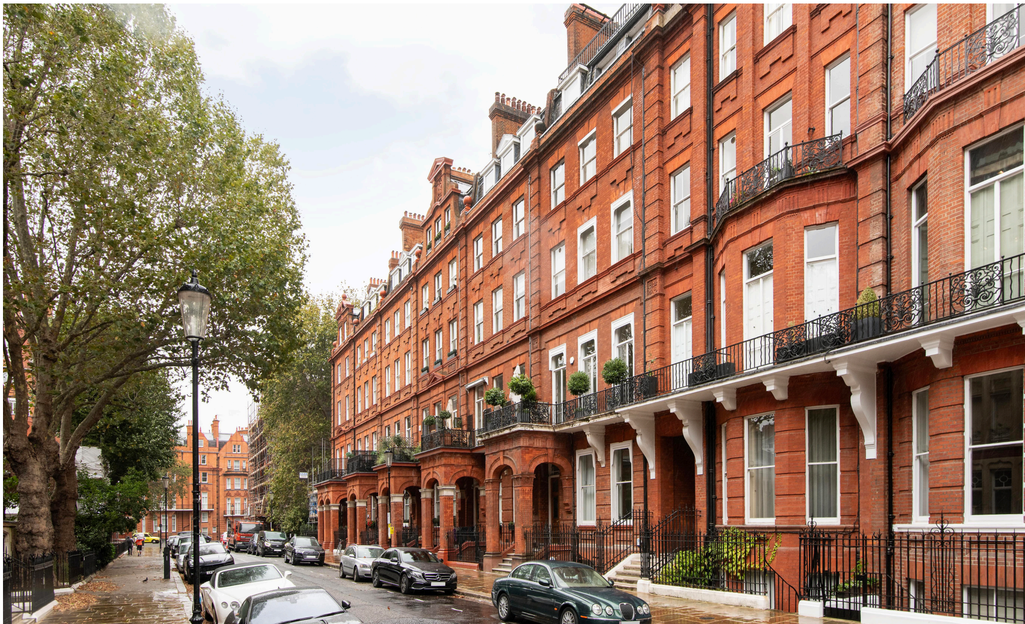
Cadogan Square, Knightsbridge SW1X