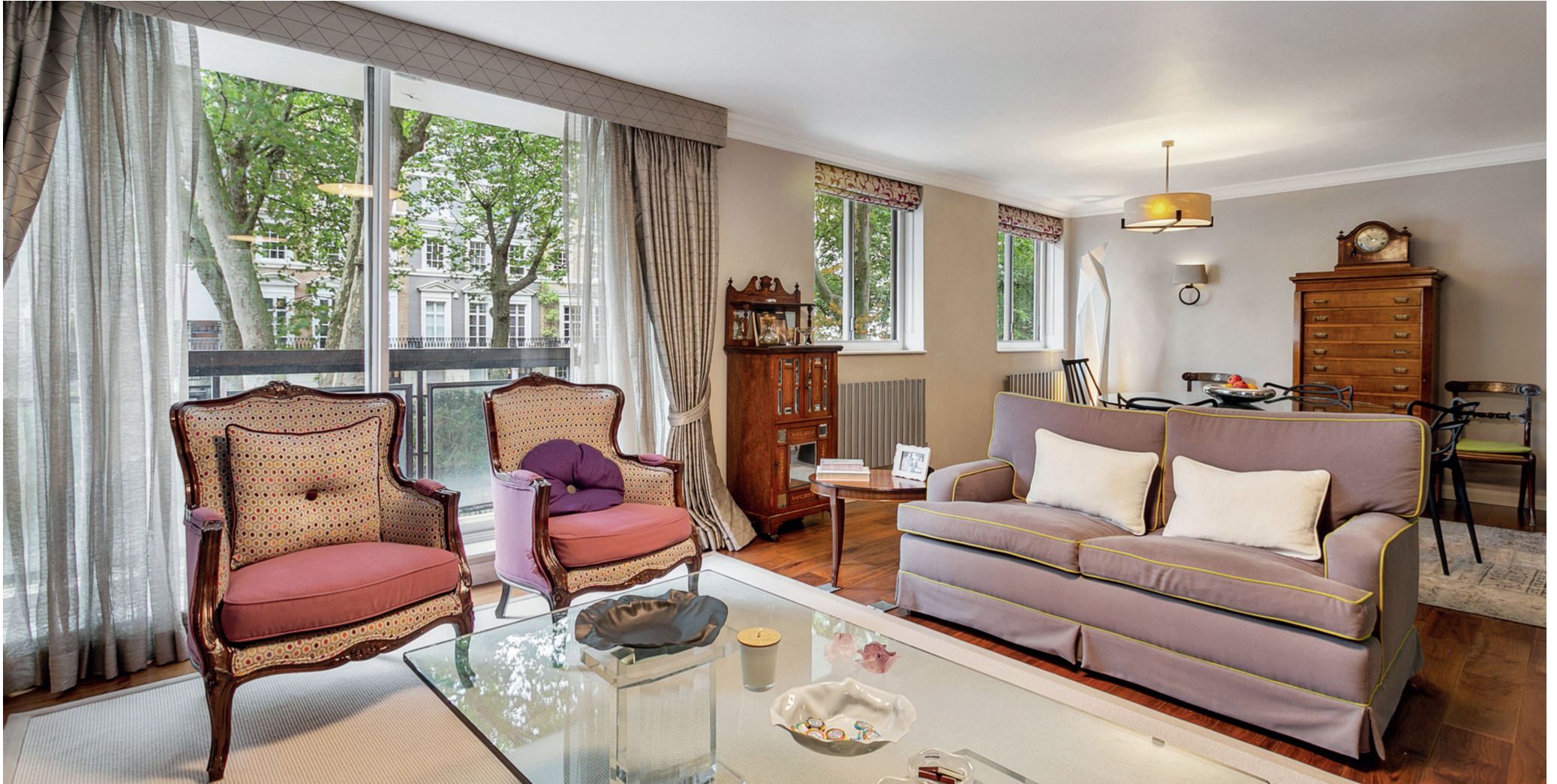
RUTLAND GATE, Knightsbridge SW7