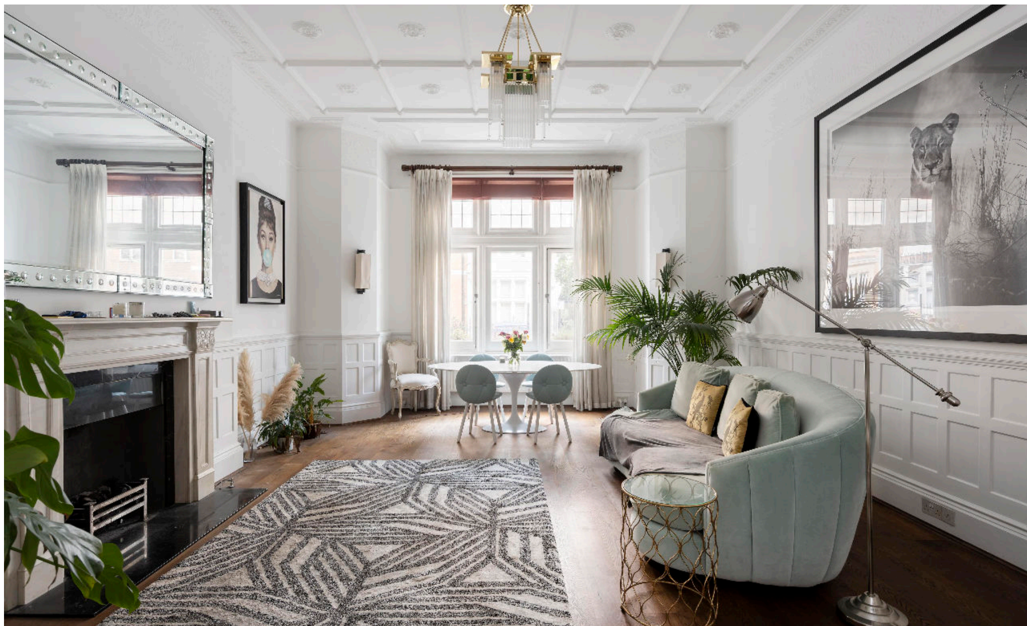
Palace Court, London W2