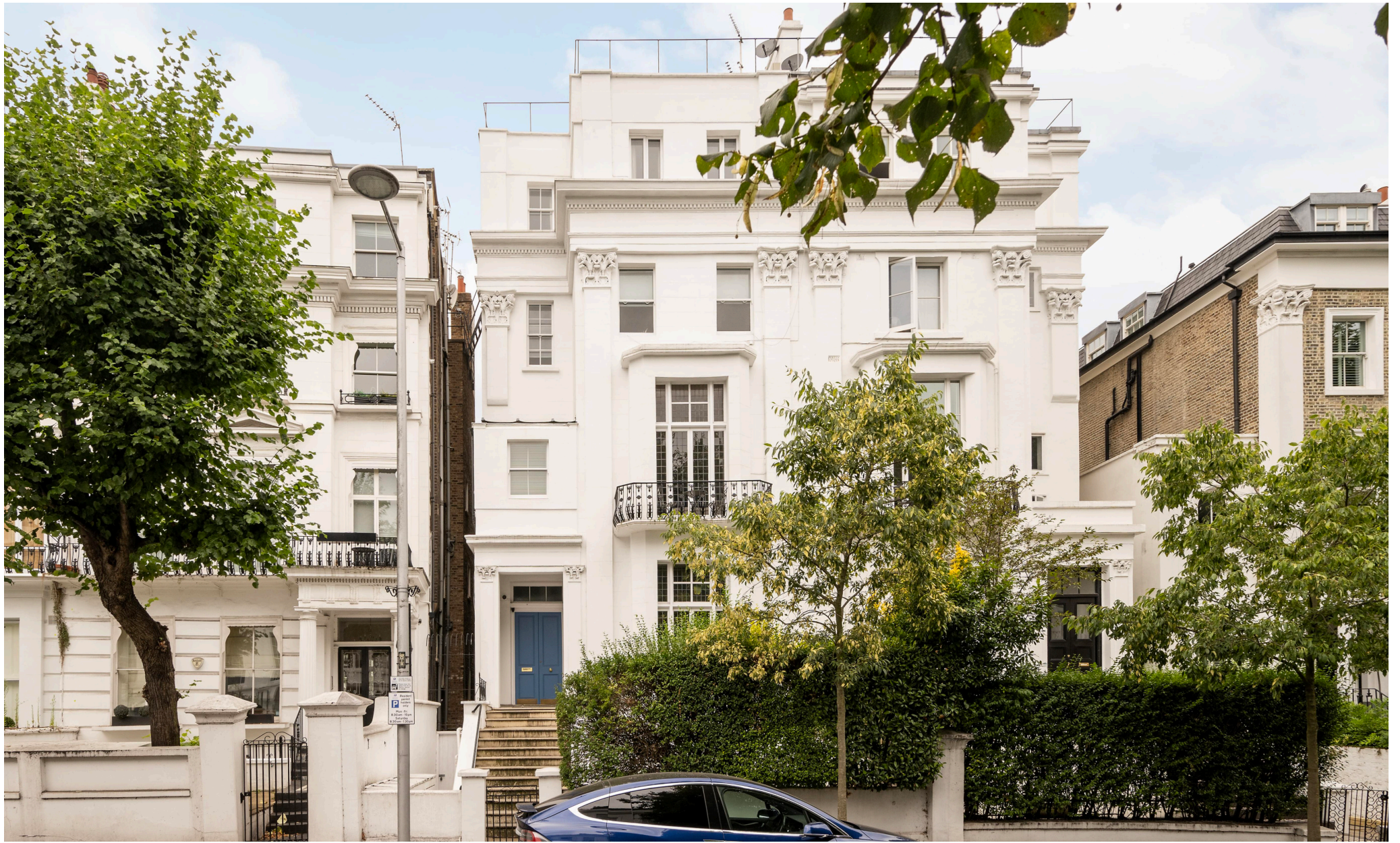
Pembridge Villas, London W11