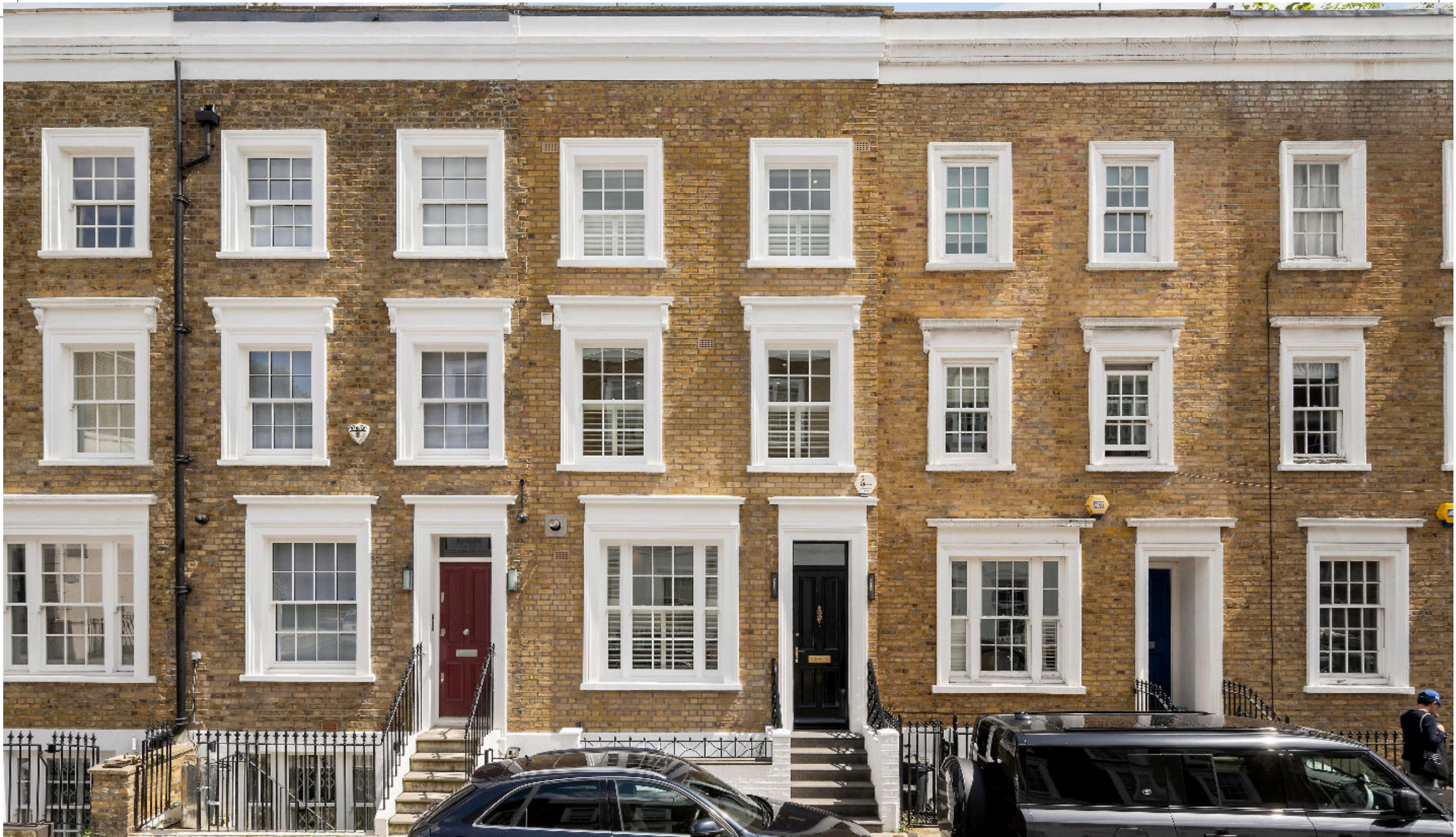
Princesdale Road, Notting Hill W11