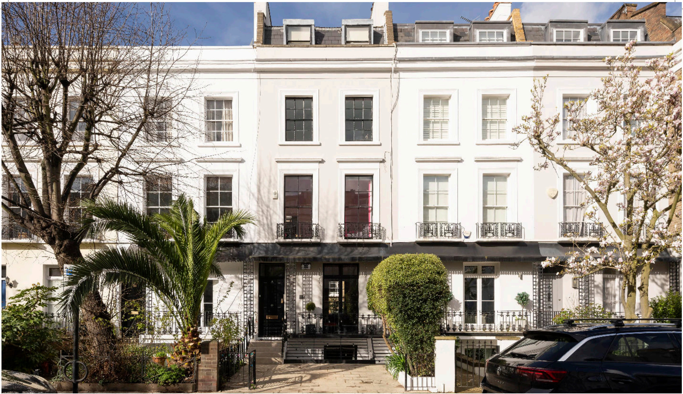
Northumberland Place, Notting Hill W2