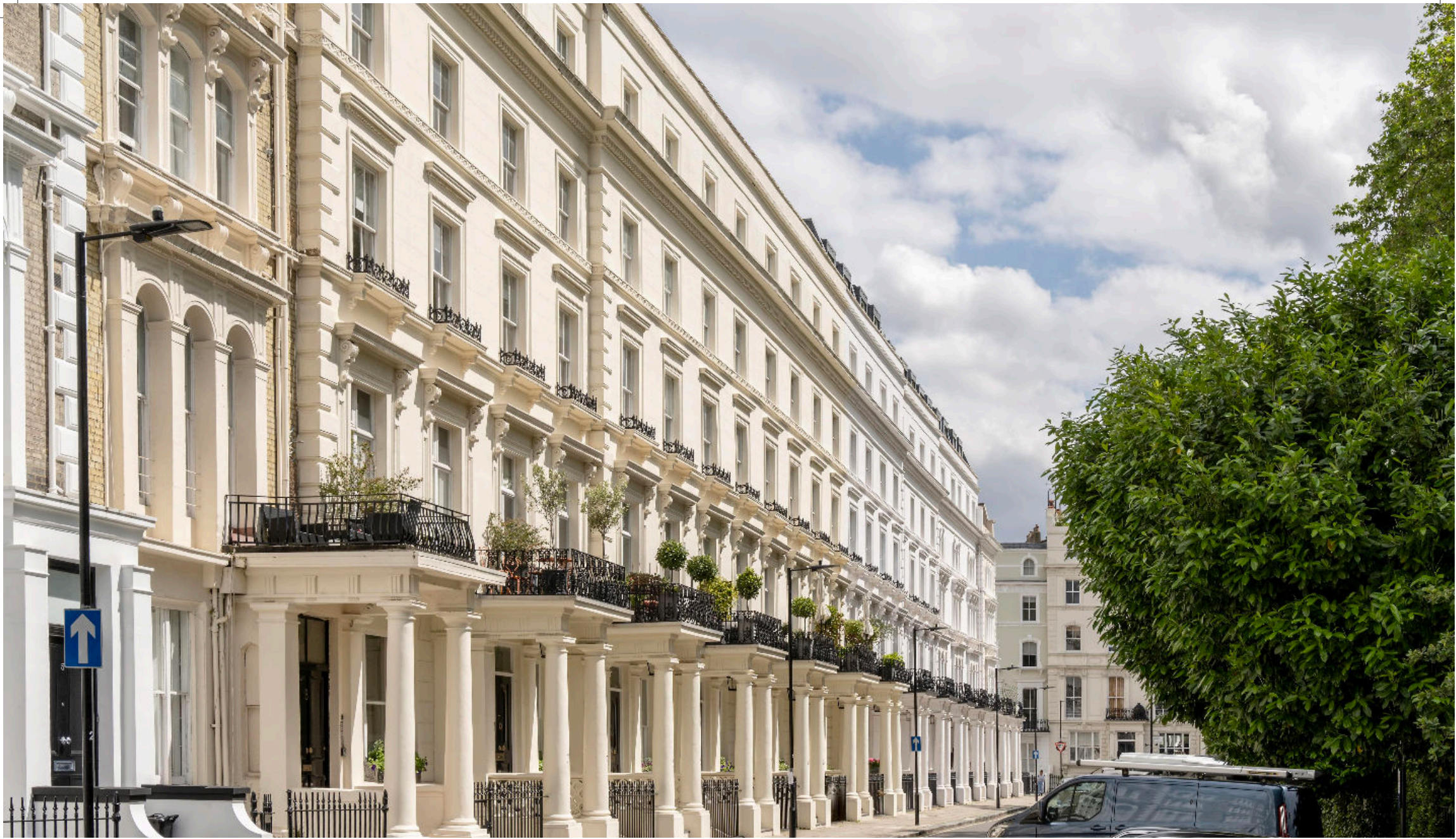
Leinster Square, Notting Hill W2