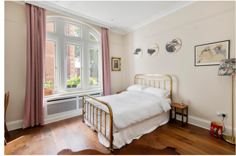
Prince Edward Mansions is exceptionally well located on Moscow road and is close to local schools and restaurants. It is close to the wonderful green spaces of Kensington Gardens and ideally placed for the amenities of Westbourne Grove and transport links of Notting Hill Gate (Circle, District and Central lines).