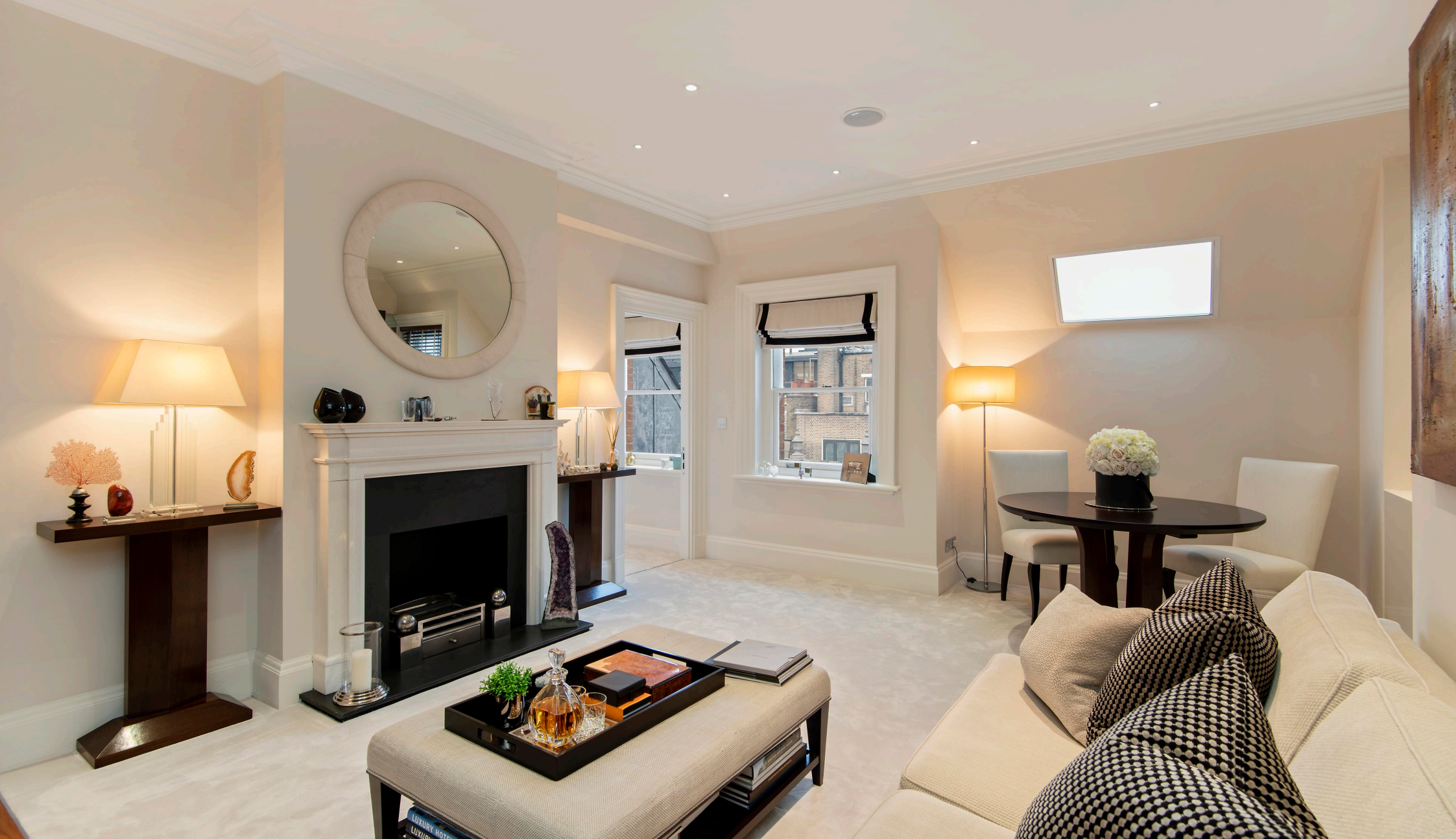
Berkeley House, Hay Hill WIJ