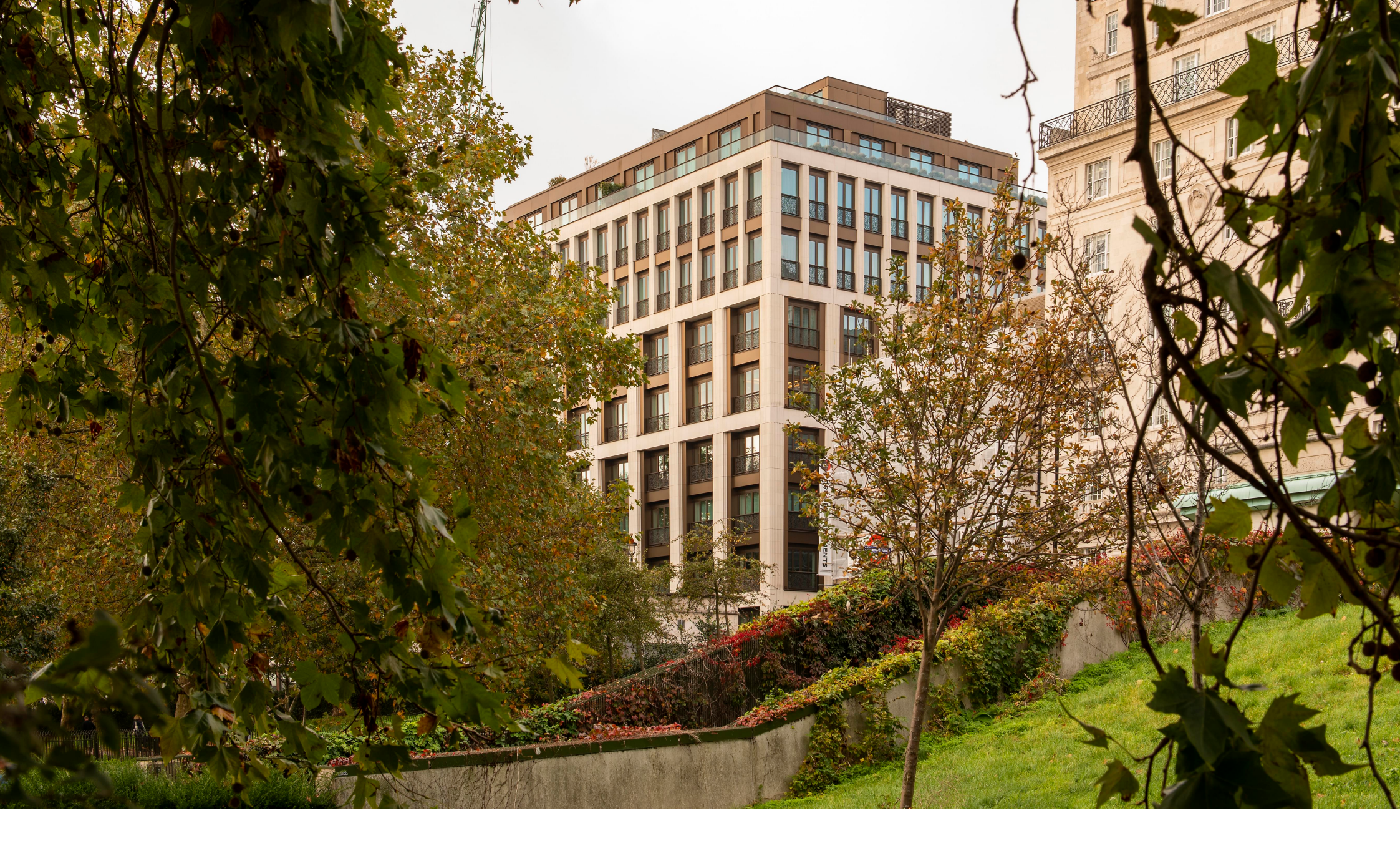
Clarges Street, Mayfair WlJ