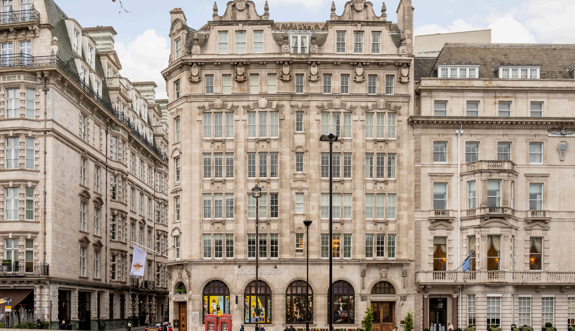
Latymer House, London WIJ