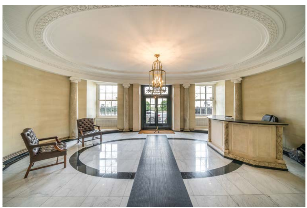
THE ENTRANCE HALL WITH 24 HOUR PORTERAGE

ALL PRINCIPAL ROOMS LEAD OFF A GENEROUS INNER RECEPTION HALL WITH A REAR SOUTH FACING BALCONY. THE APARTMENT FURTHER BENEFITS FROM GENEROUS STAFF ACCOMMODATION AT THE REAR AND A LARGE, FUNCTIONAL KITCHEN.