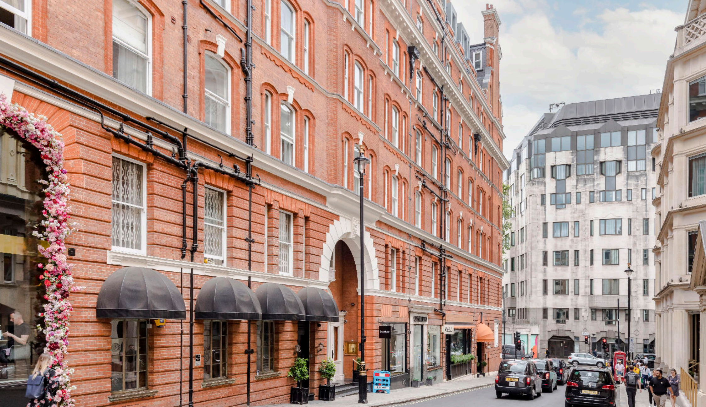
Berkeley House, Hay Hill W1J