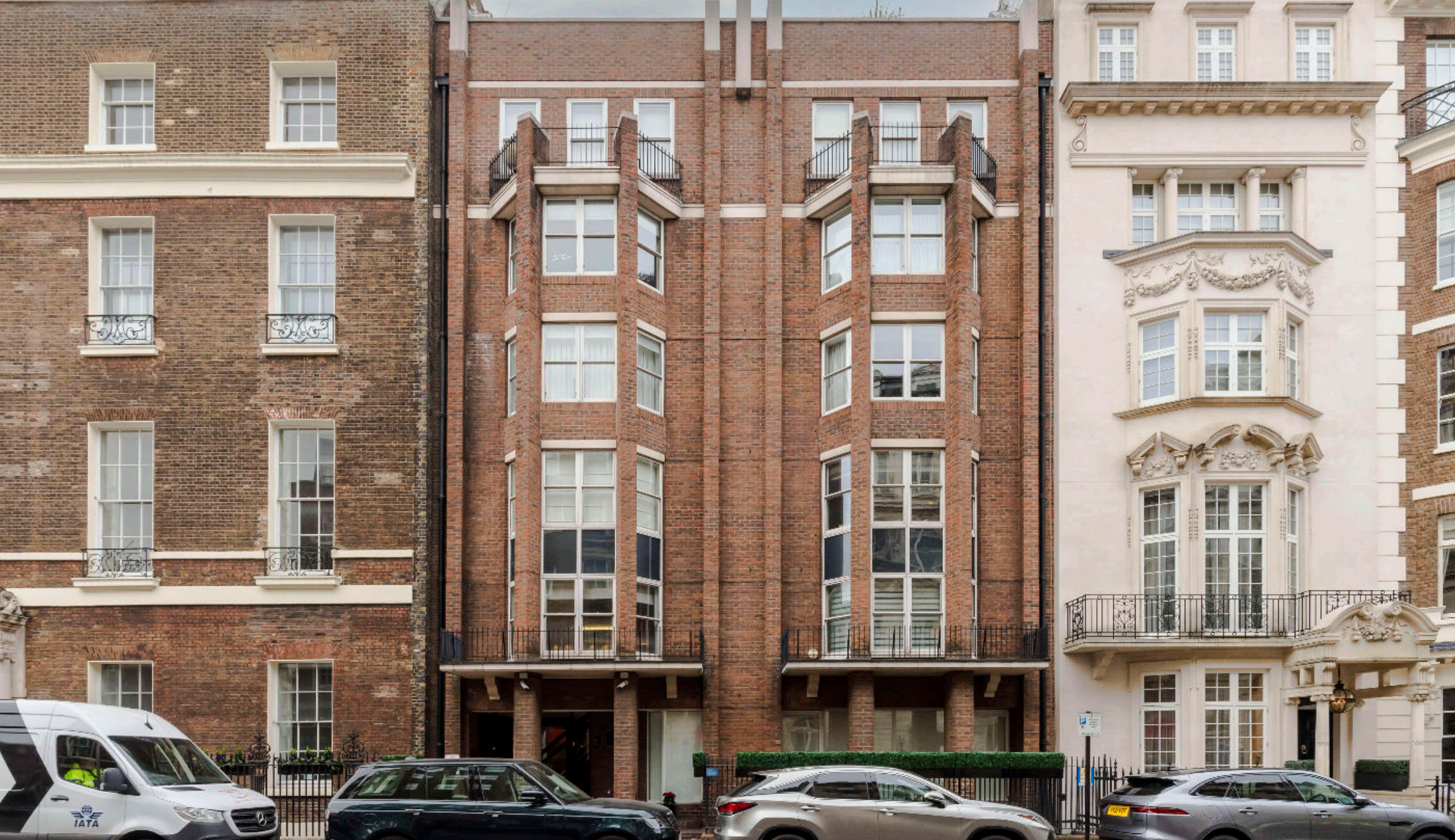
Rosebery Court, Charles Street WIJ