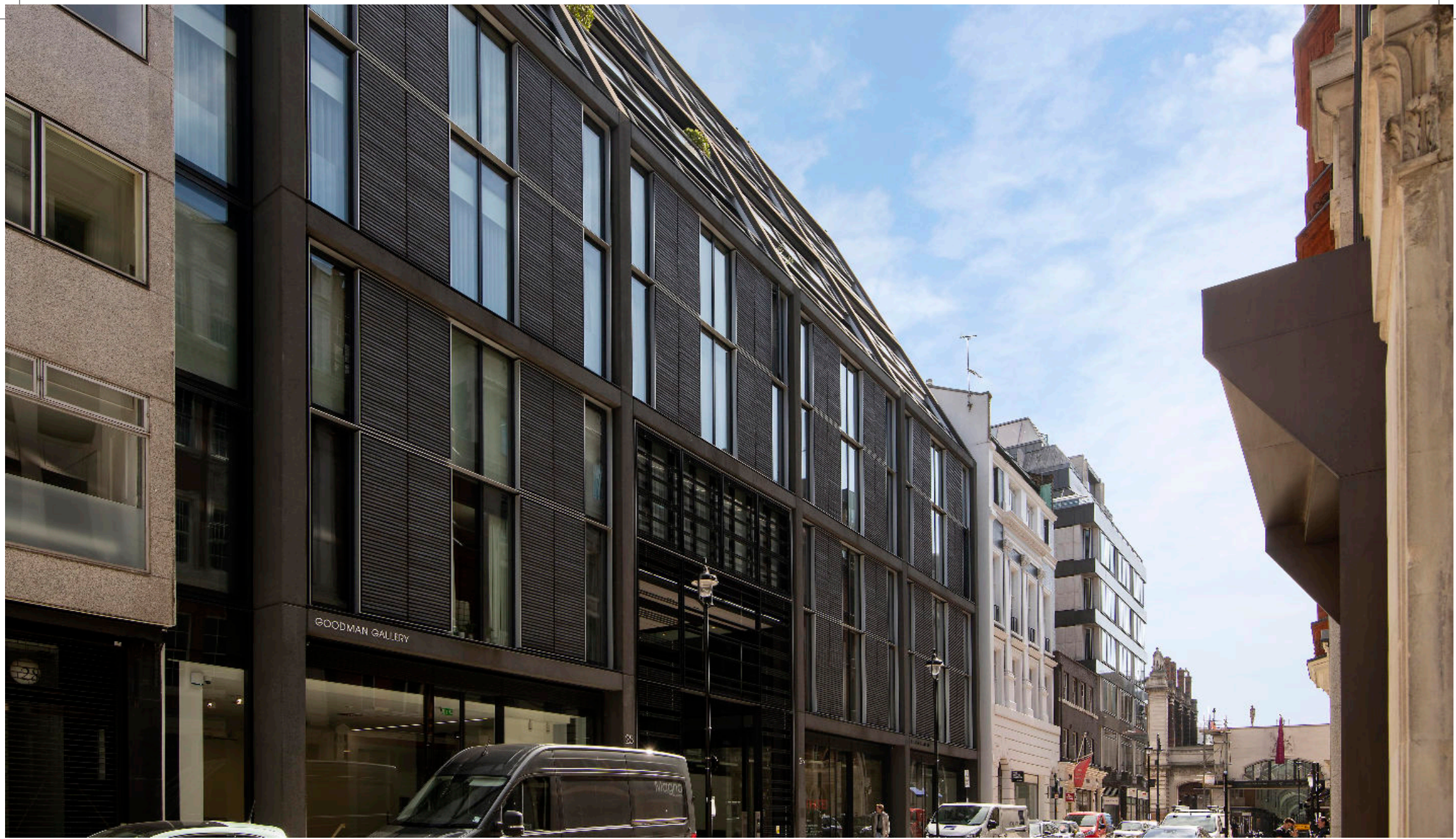
Burlington Gate, Cork Street WIS