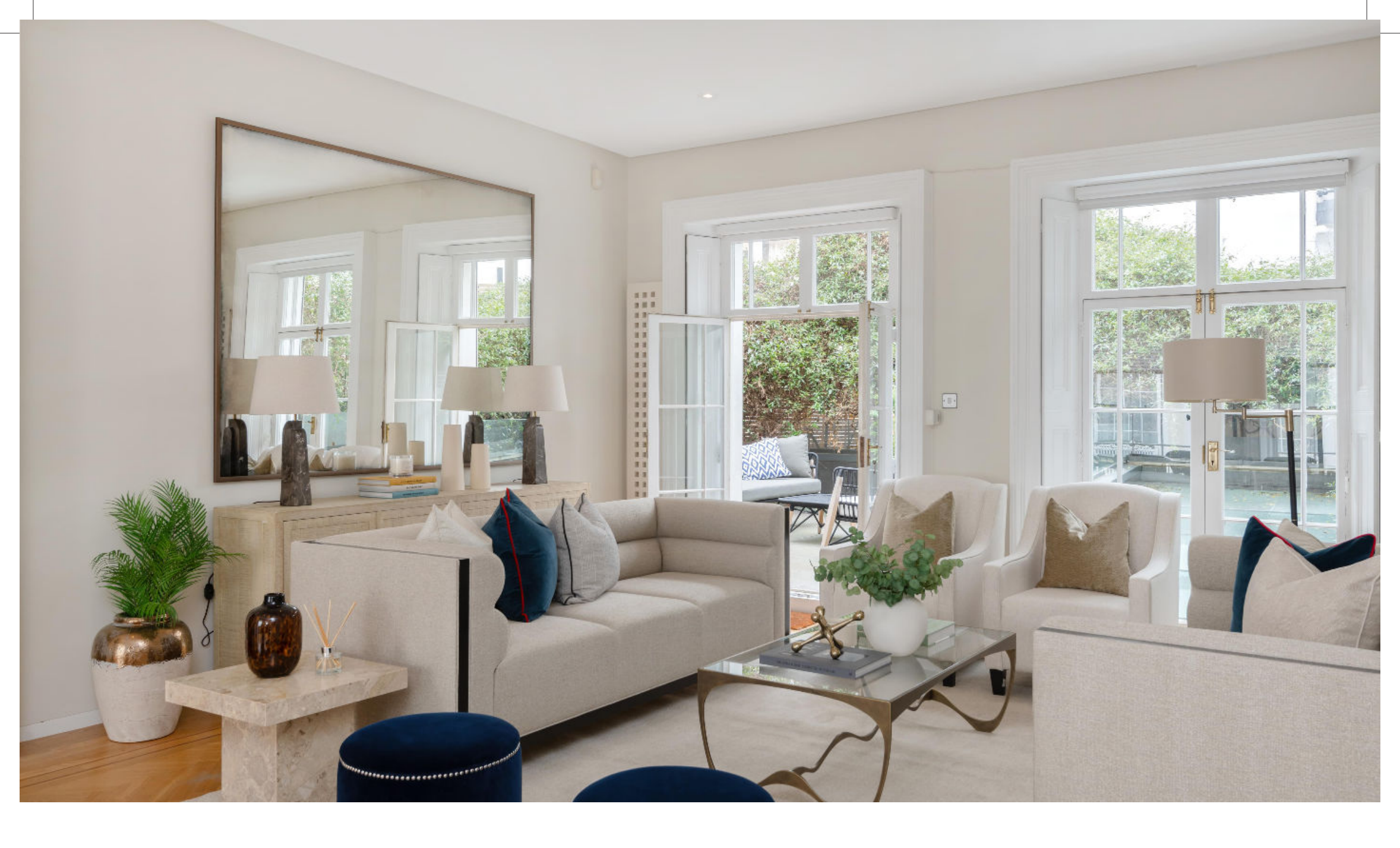
Cambridge Place, Kensington W8