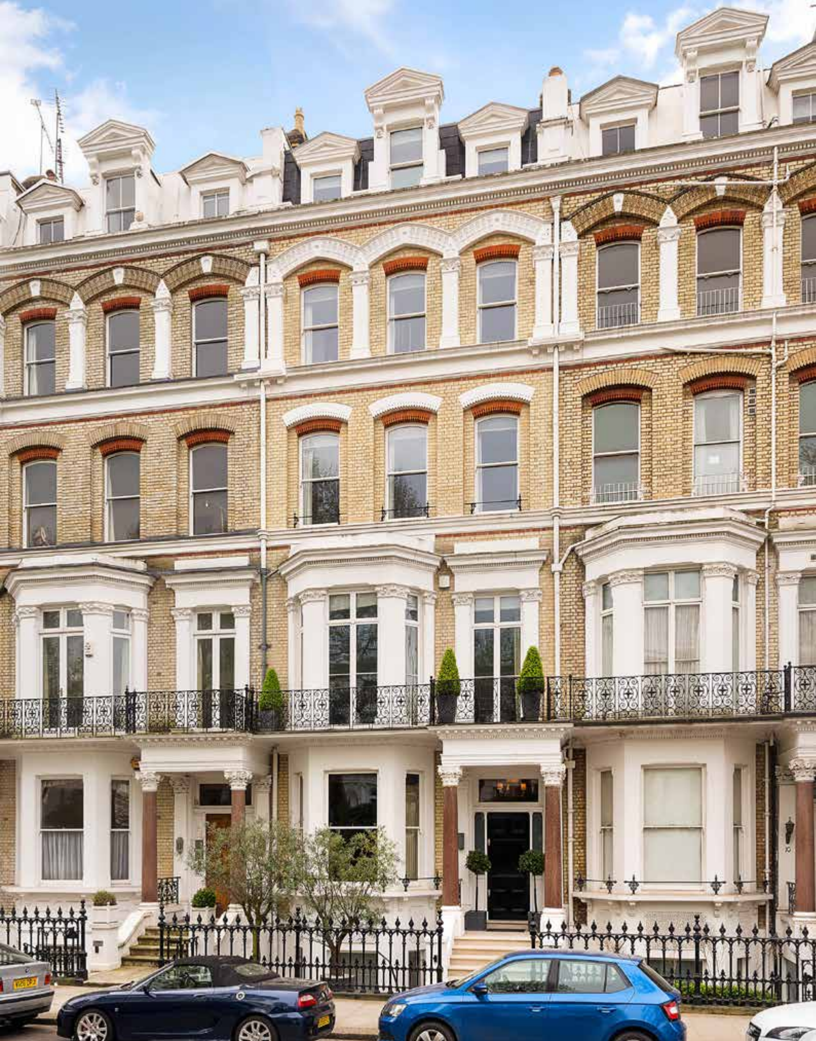
Vicarage Gate, Kensington, W8