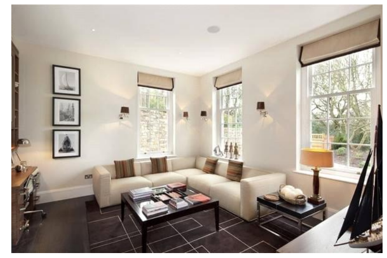
Wildwood Road is one of the most desirable roads in Hampstead Garden Suburb and the house is positioned immediately opposite the Heath Extension.

This home offers breathtaking views of Hampstead Heath Extension and provides ample parking with garage and driveway parking for multiple cars.