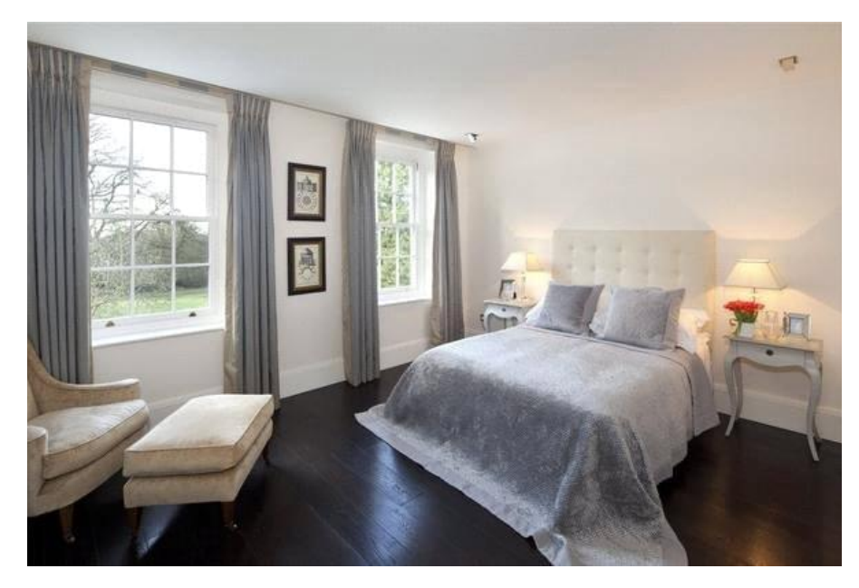
A magnificent detached family house.