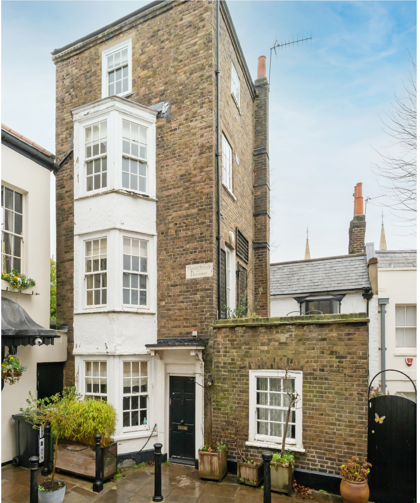
HOLLY MOUNT NW3