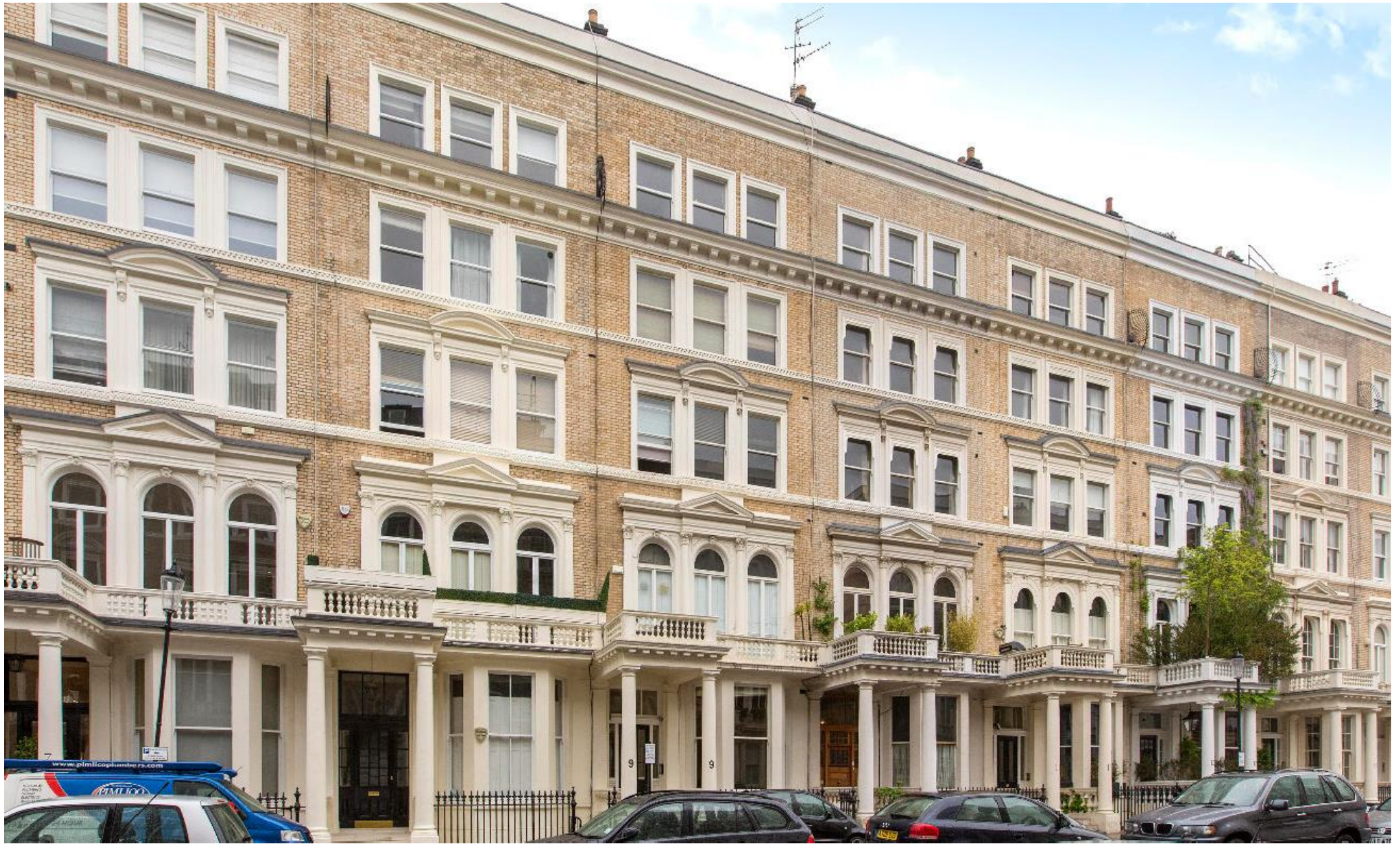
Queen's Gate Place, South Kensington SW7