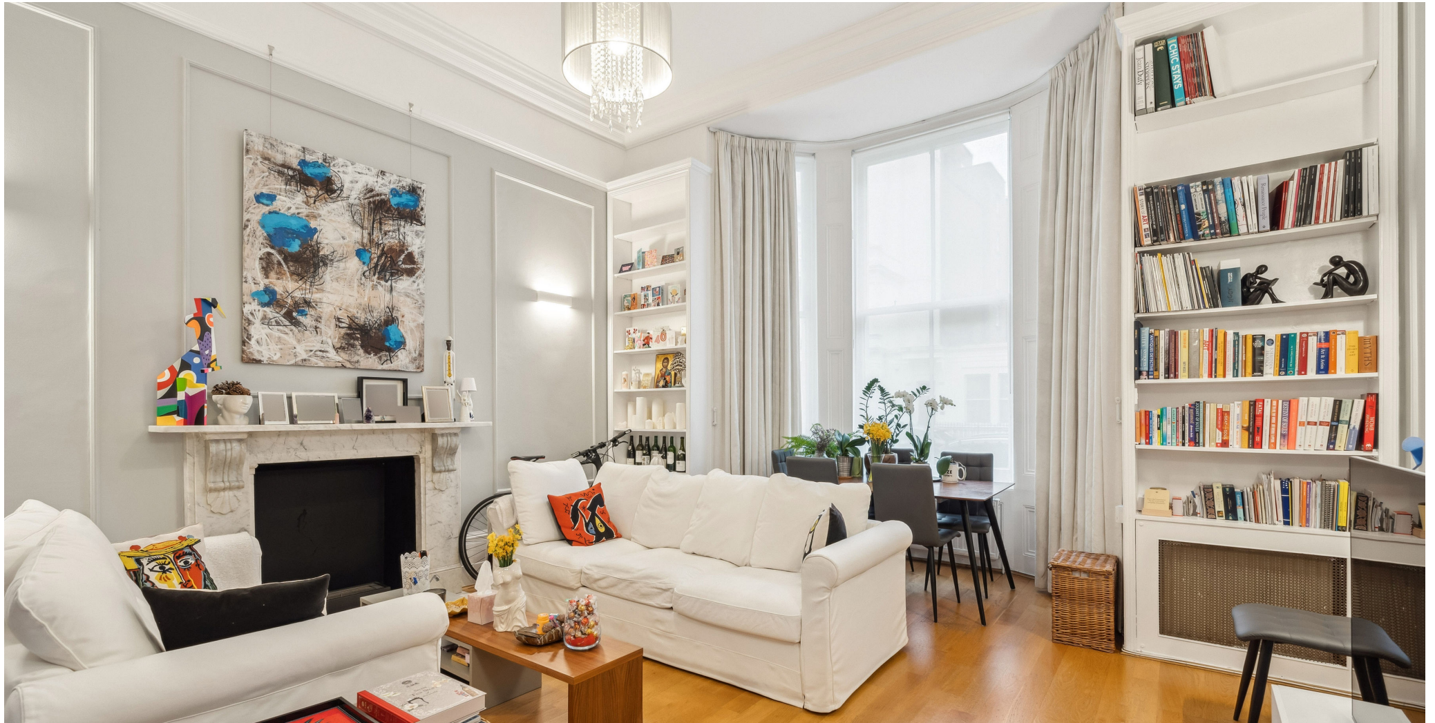
QUEEN'S GATE PLACE South Kensington, SW7