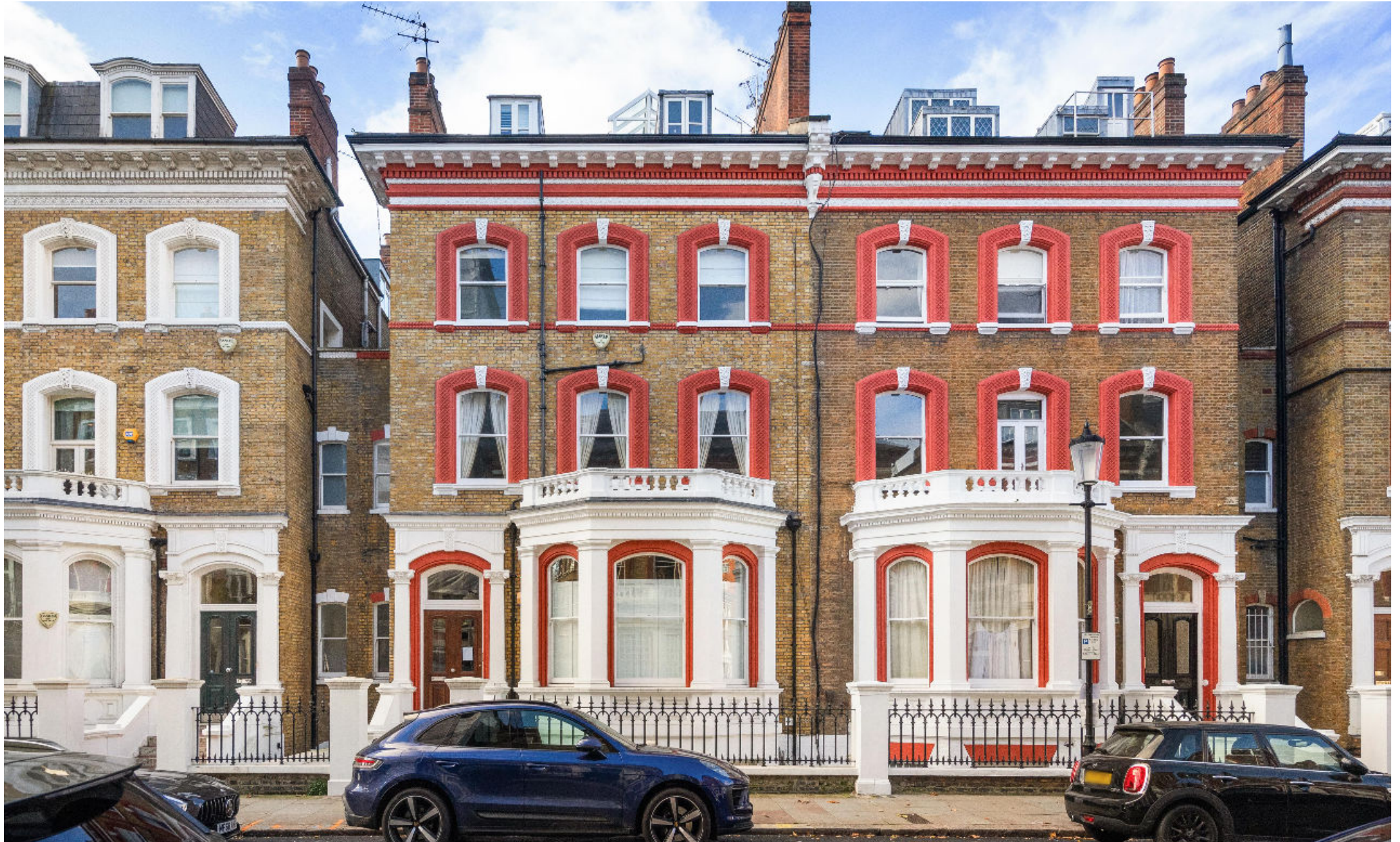
Roland Gardens, South Kensington SW7