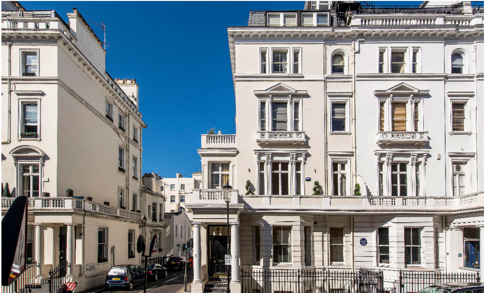
Queensberry Place, South Kensington SW7