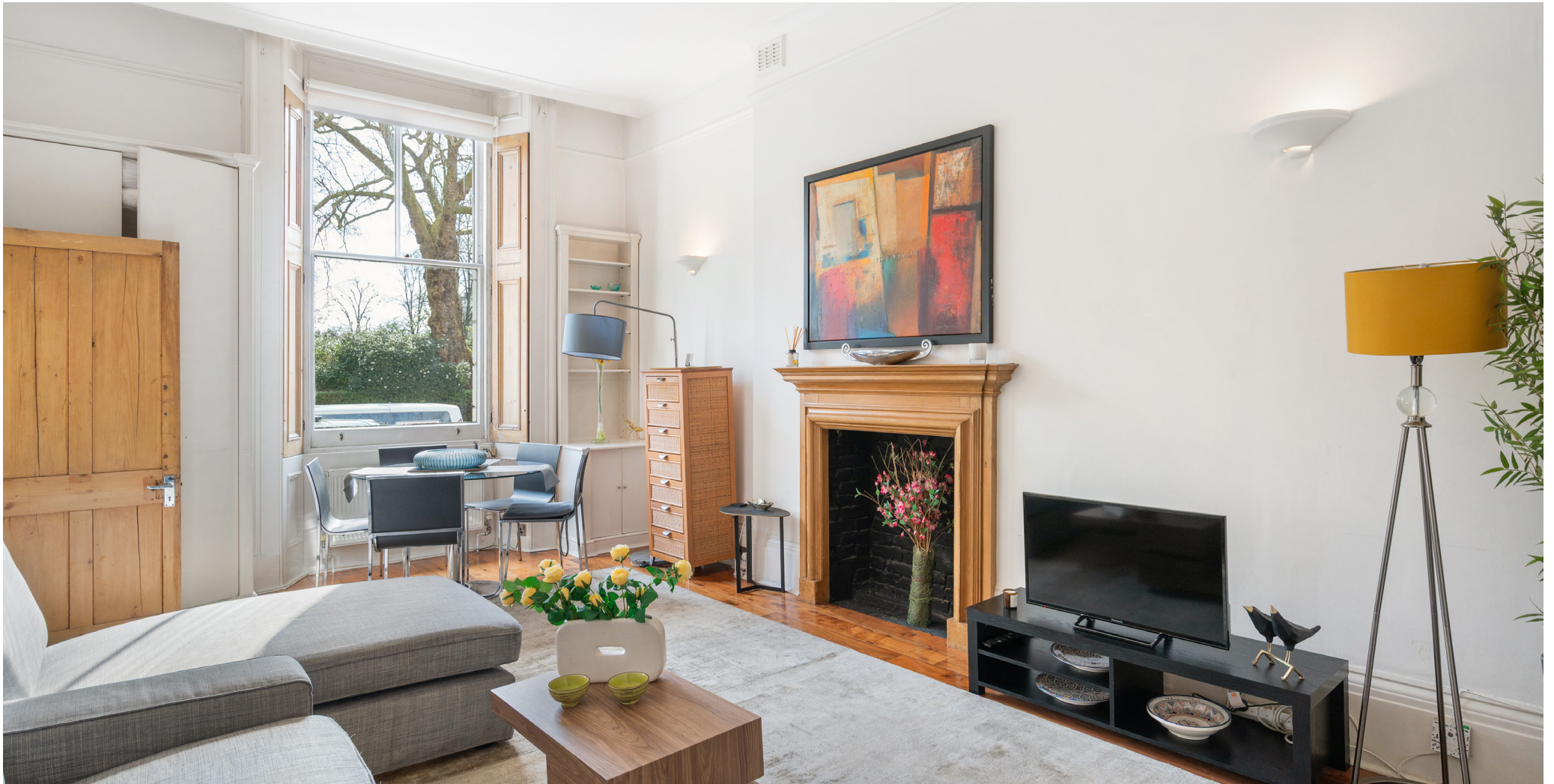
QUEEN'S GATE South Kensington, SW7