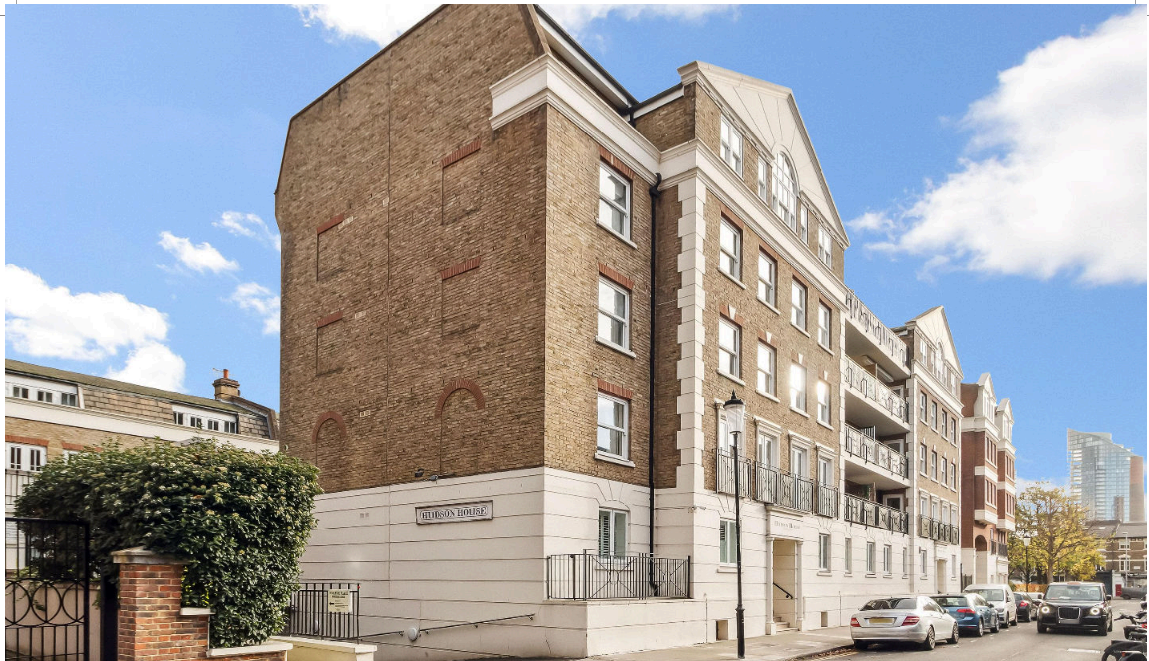
Hortensia Road, London SW10