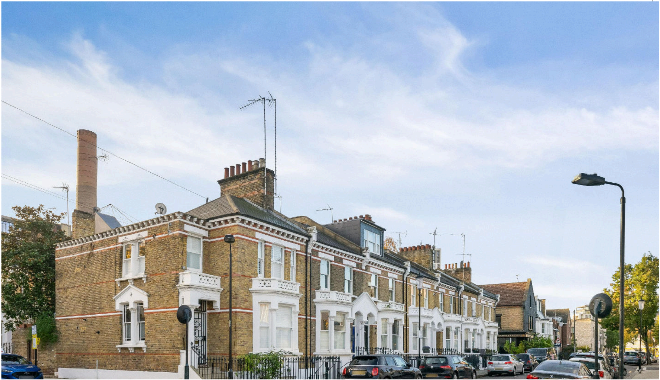
Burnaby Street, Chelsea SW10