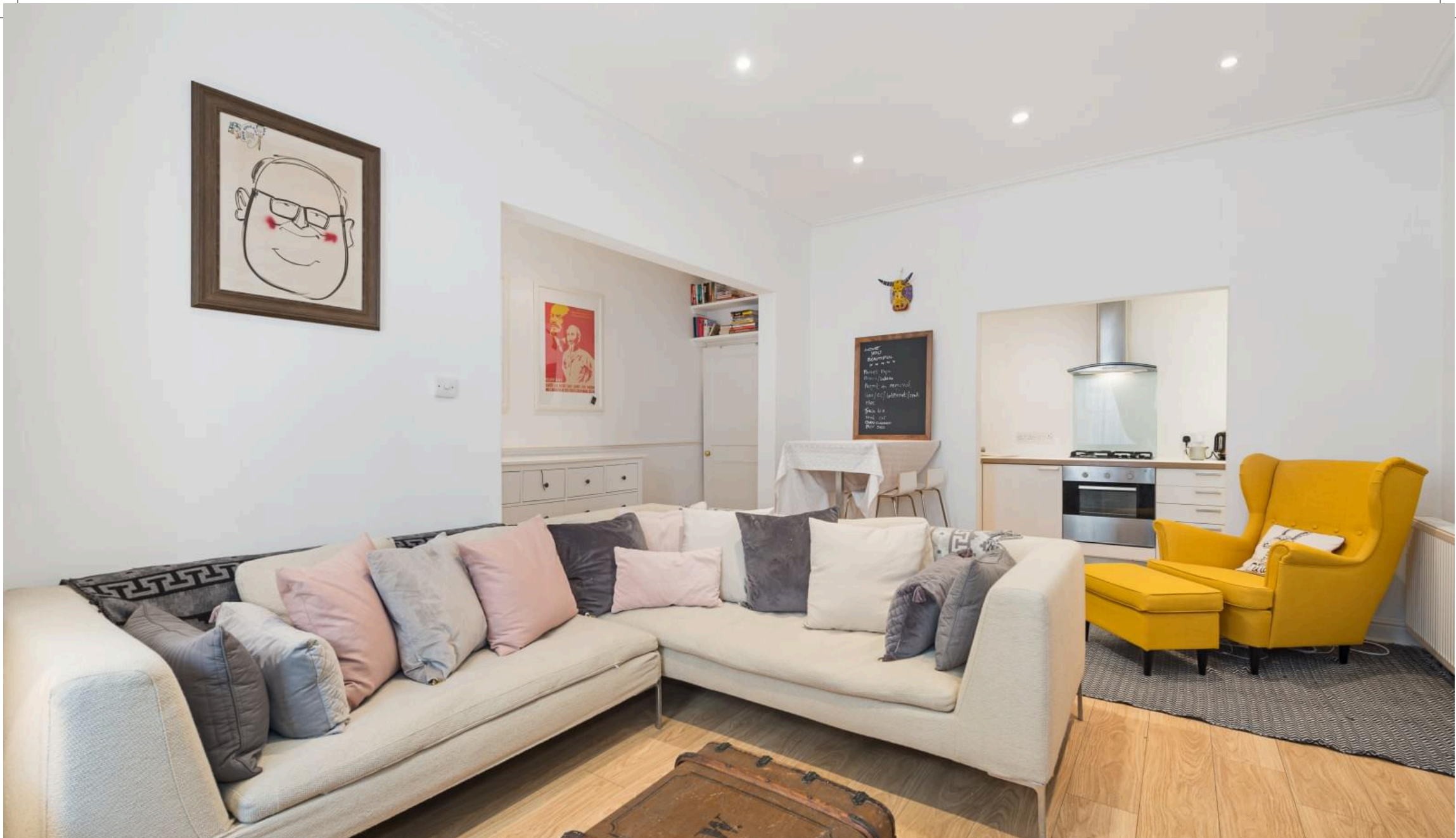
Westgate Terrace, London SW10