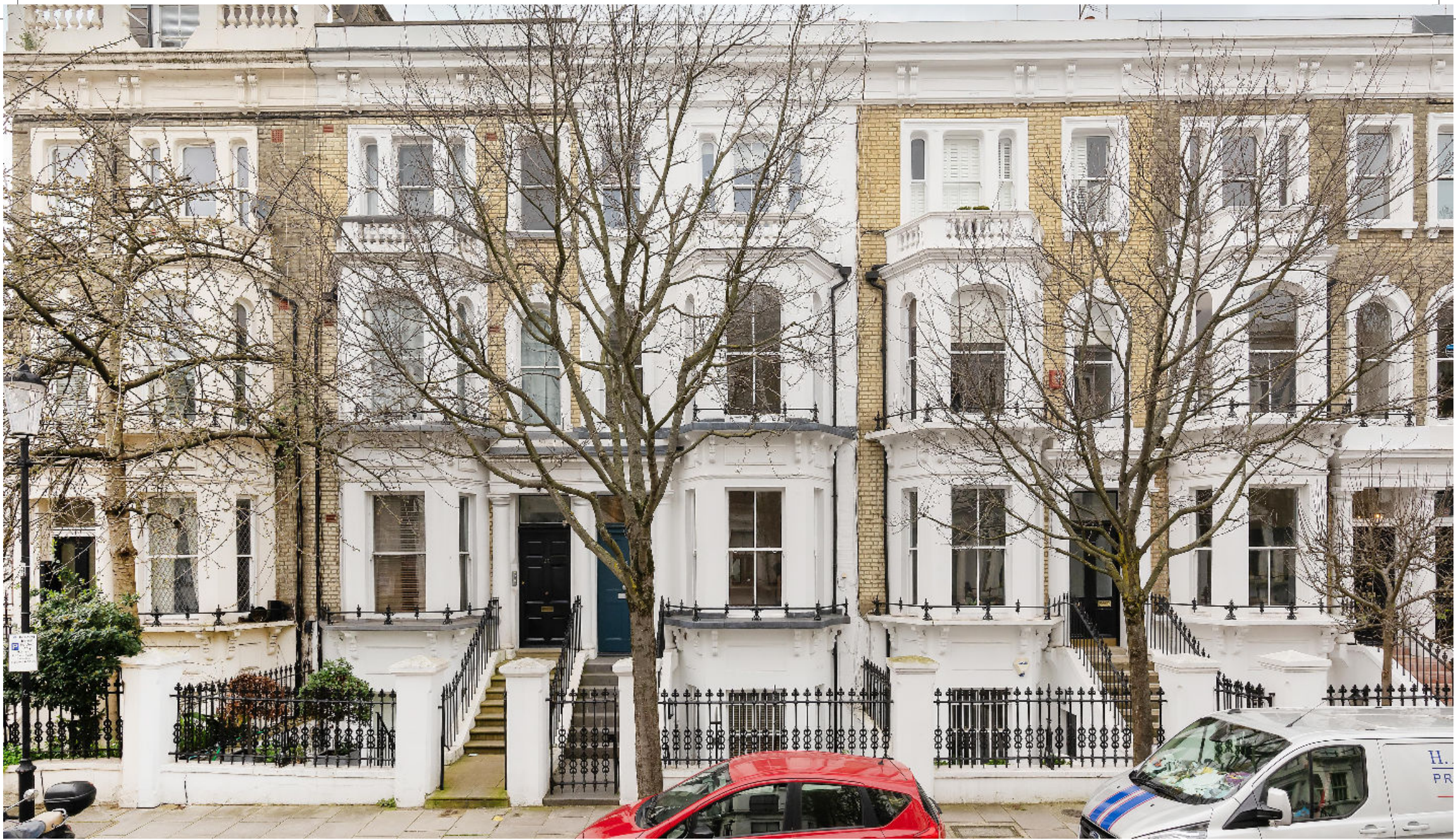
Redcliffe Street, London SW10