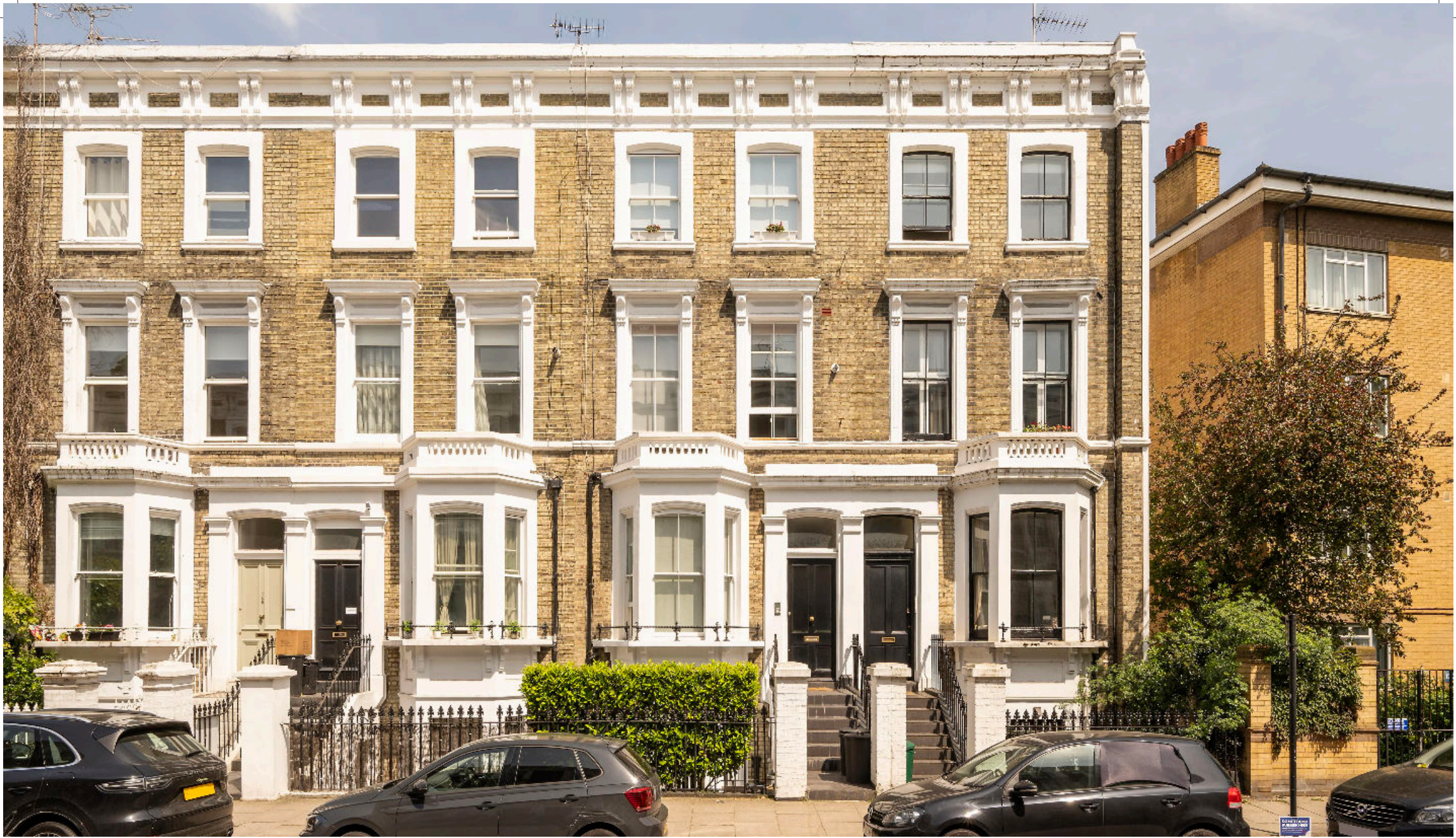
Finborough Road, London SW10