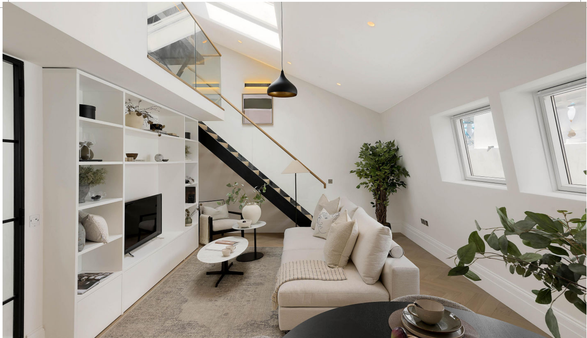
Redcliffe Gardens, London SW10