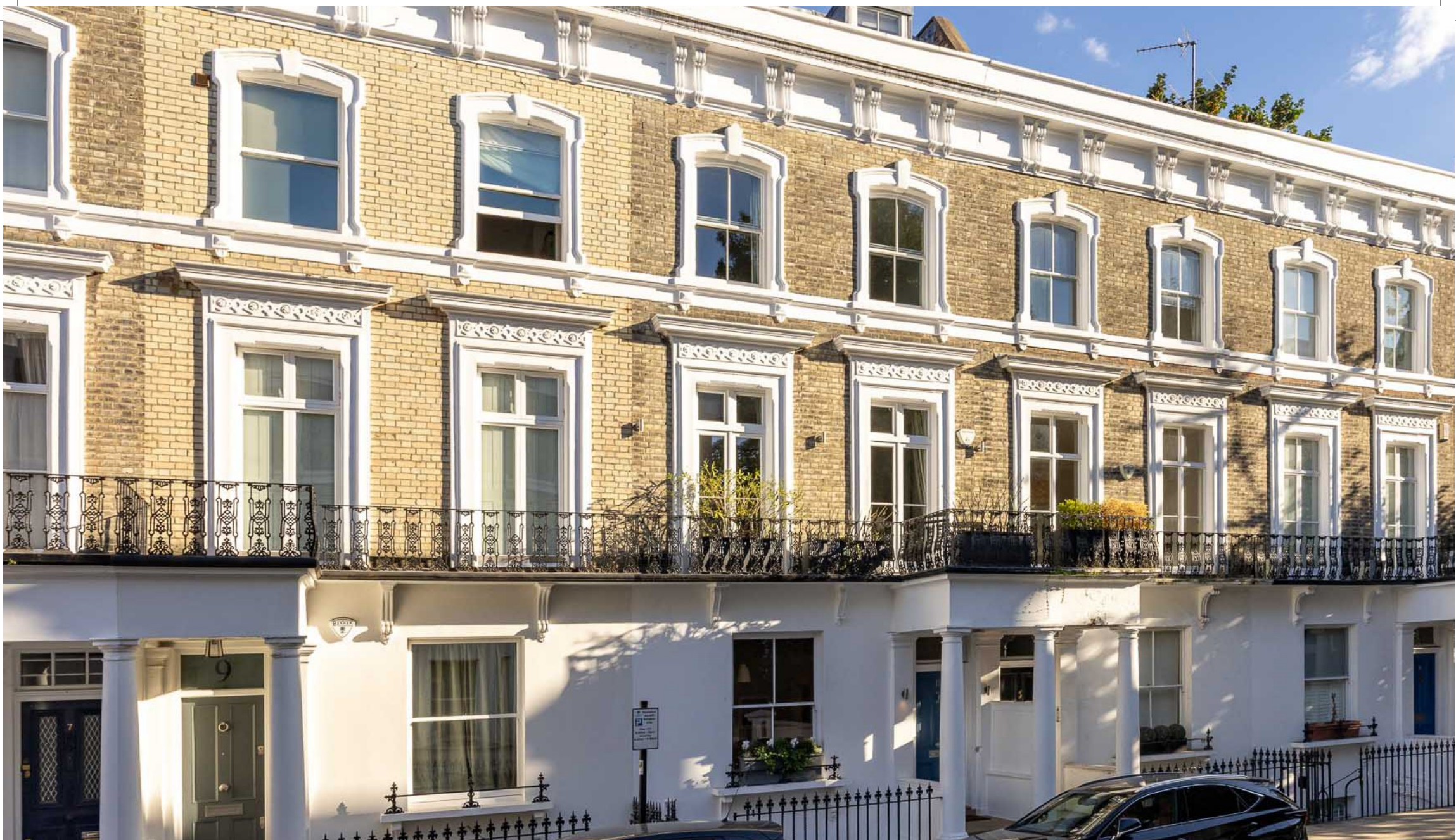
Fawcett Street, Chelsea SW10