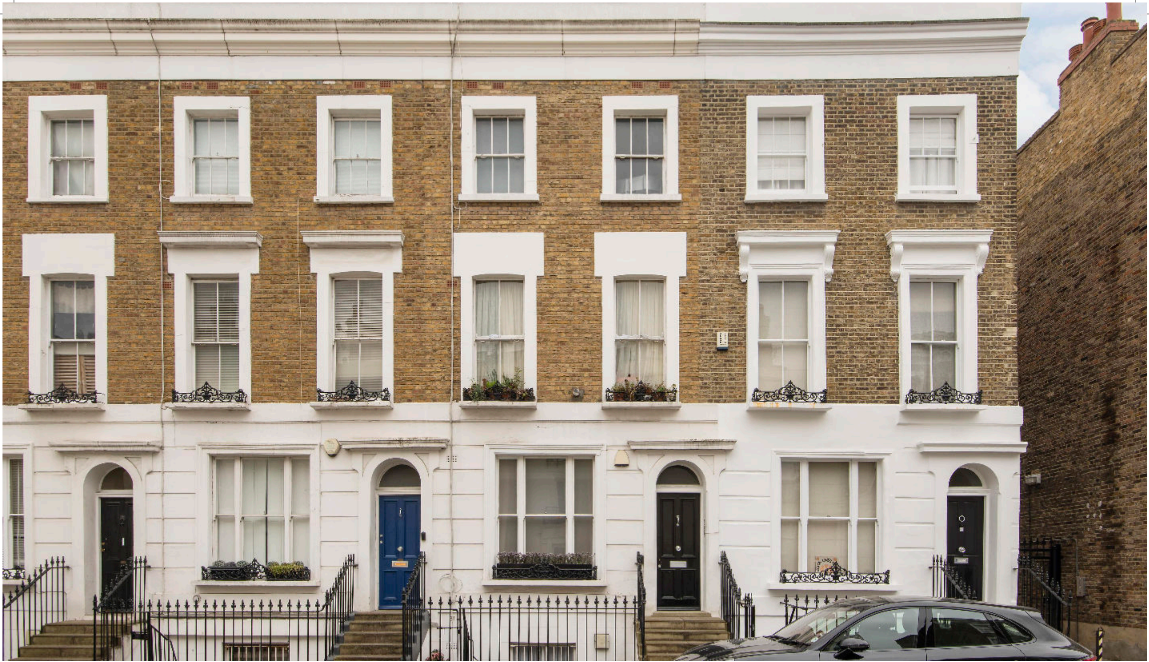
Danvers Street, London SW3