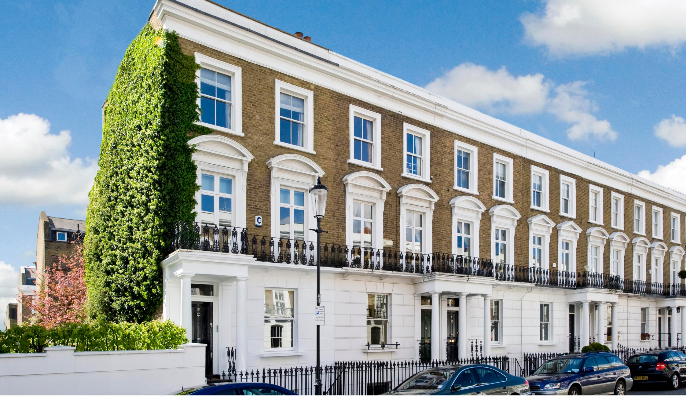
Limerston Street, Chelsea SW10