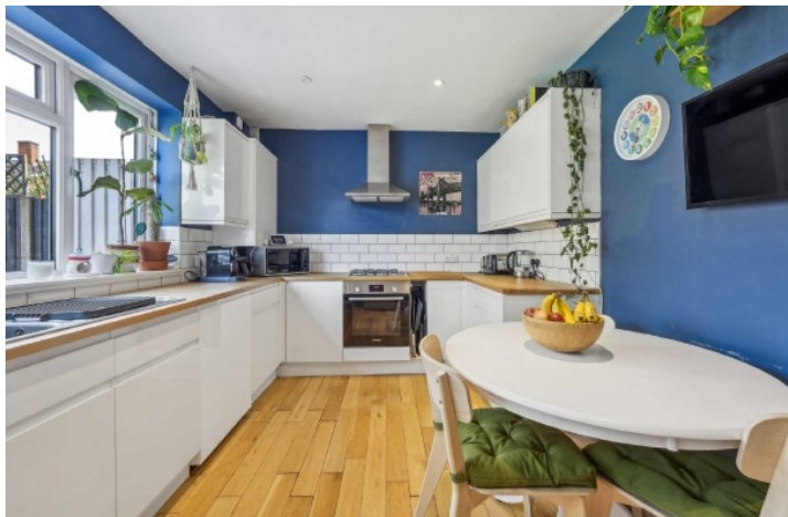
Strathdon Drive, SW17