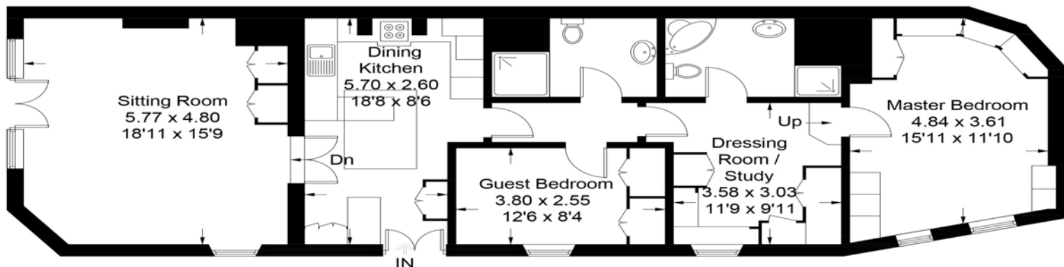
Illustration for identification purposes only, measurements are approximate, not to scale. floorplansUsketch.com © (ID565526)