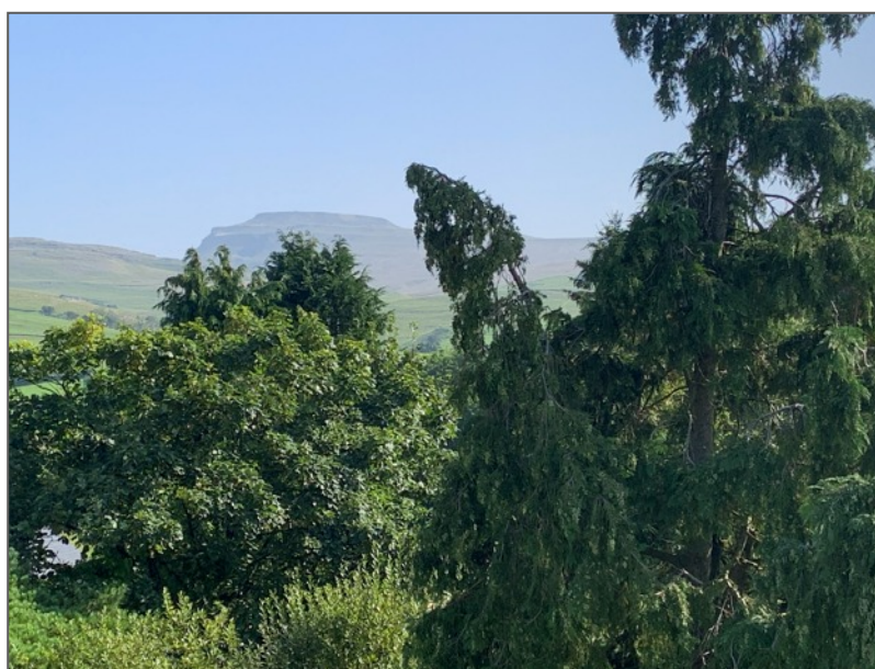
View from the sitting/dining room