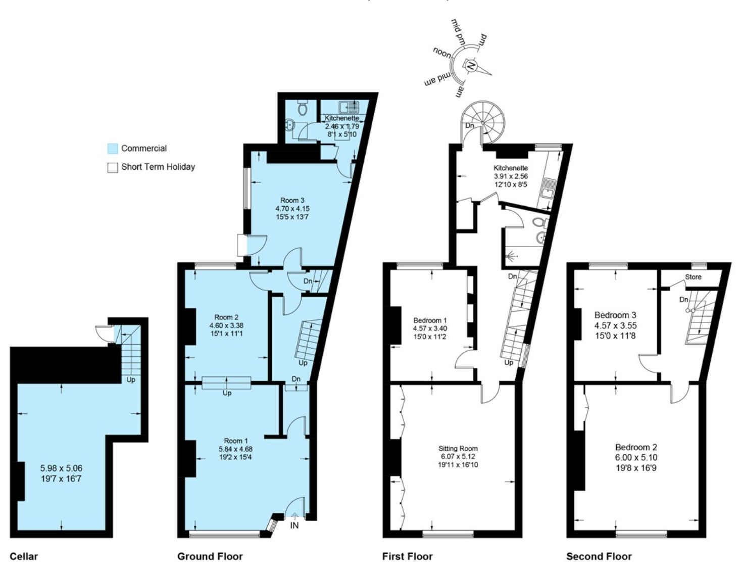
Illustration for identification purposes only, measurements are approximate, not to scale. Fourlabs.co @ (ID1146294)

Short Term Holiday Let = 132 sq m / 1421 sq ft Commercial and Cellar = 108 sq m / 1162 sq ft Total = 240 sq m / 2583 sq ft