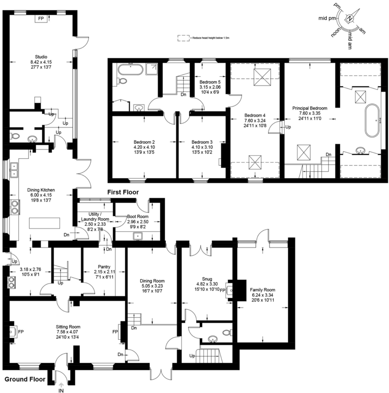
Illustration for identification purposes only, measurements are approximate, not to scale. Fourlabs.co © (ID1132620)