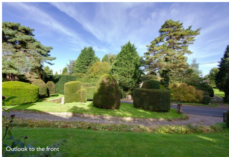
Outlook to the front