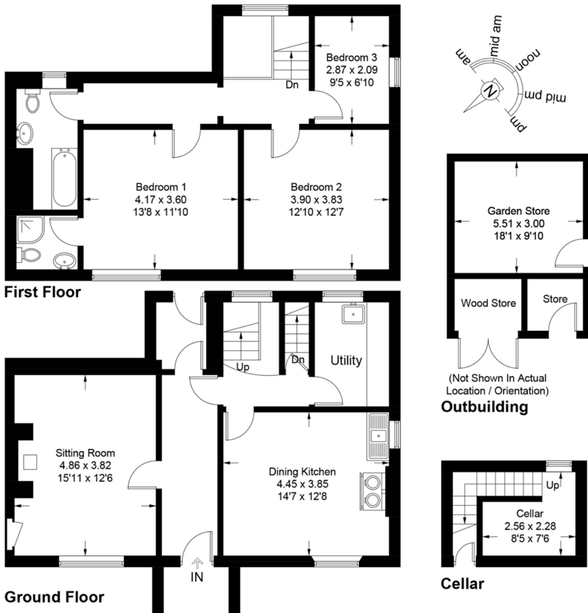
Illustration for identification purposes only, measurements are approximate, not to scale. floorplansUsketch.com © (ID1126583)