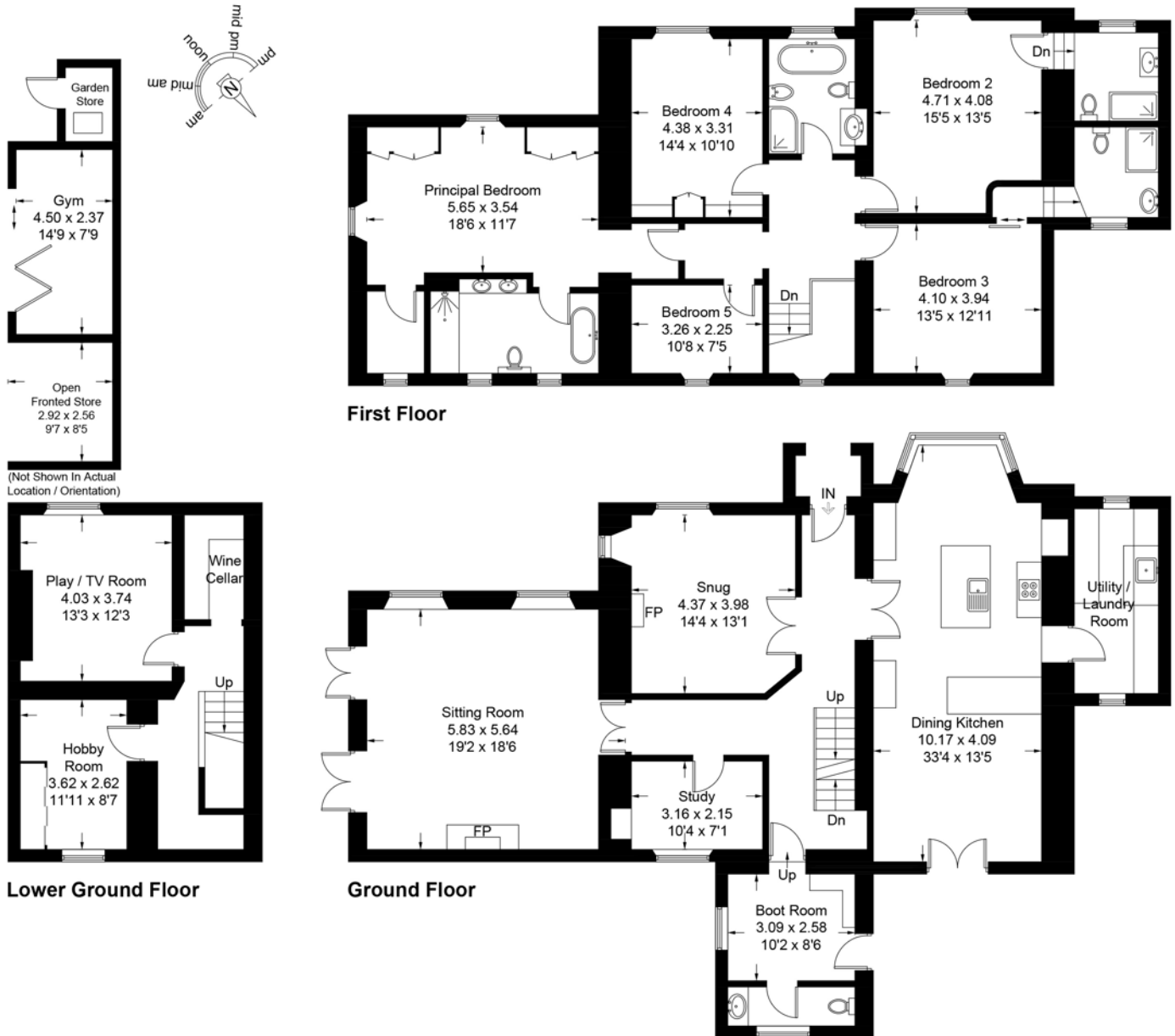
Illustration for identification purposes only, measurements are approximate, not to scale. floorplansUsketch.com © (ID1112891)

Approximate Gross Internal Area = 333.8 sq m / 3593 sq ft Outbuilding = 12.9 sq m / 139 sq ft Total = 346.7 sq m / 3732 sq ft