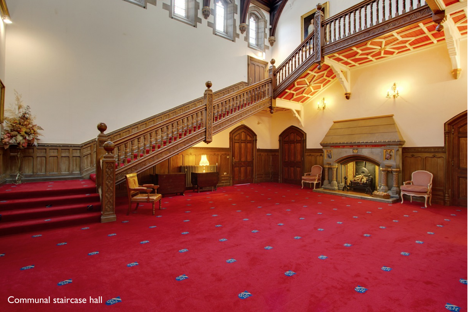
Communal staircase hall