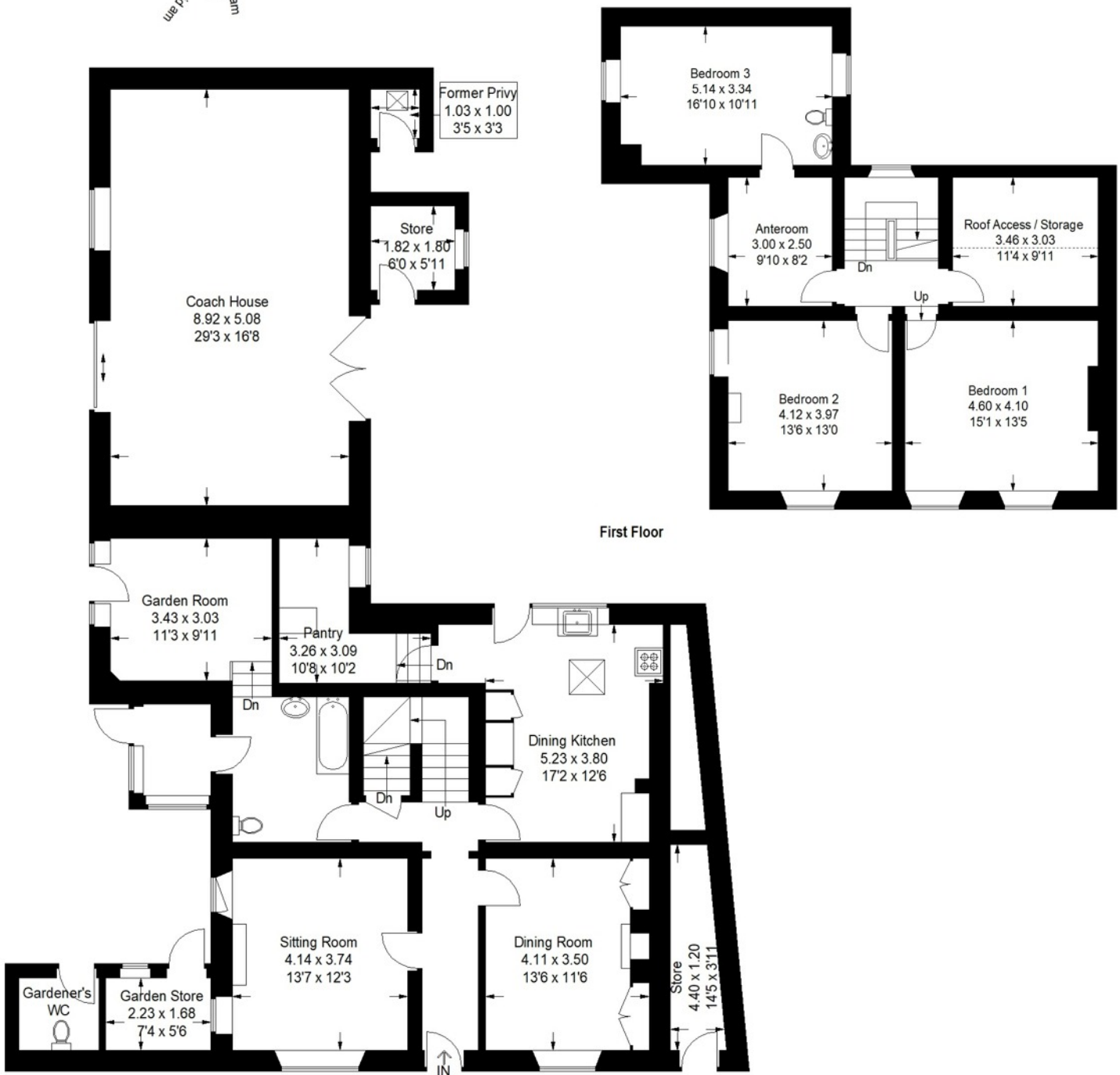
Illustration for identification purposes only, measurements are approximate, not to scale. FloorplansUsketch.com © (ID1070387)

Approximate Gross Internal Area = 184.3 sq m / 1984 sq ft Stores = 10.8 sq m / 116 sq ft Coach House = 46.9 sq m / 505 sq ft Outbuildings = 8.0 sq m / 86 sq ft Total = 250.0 sq m / 2691 sq ft