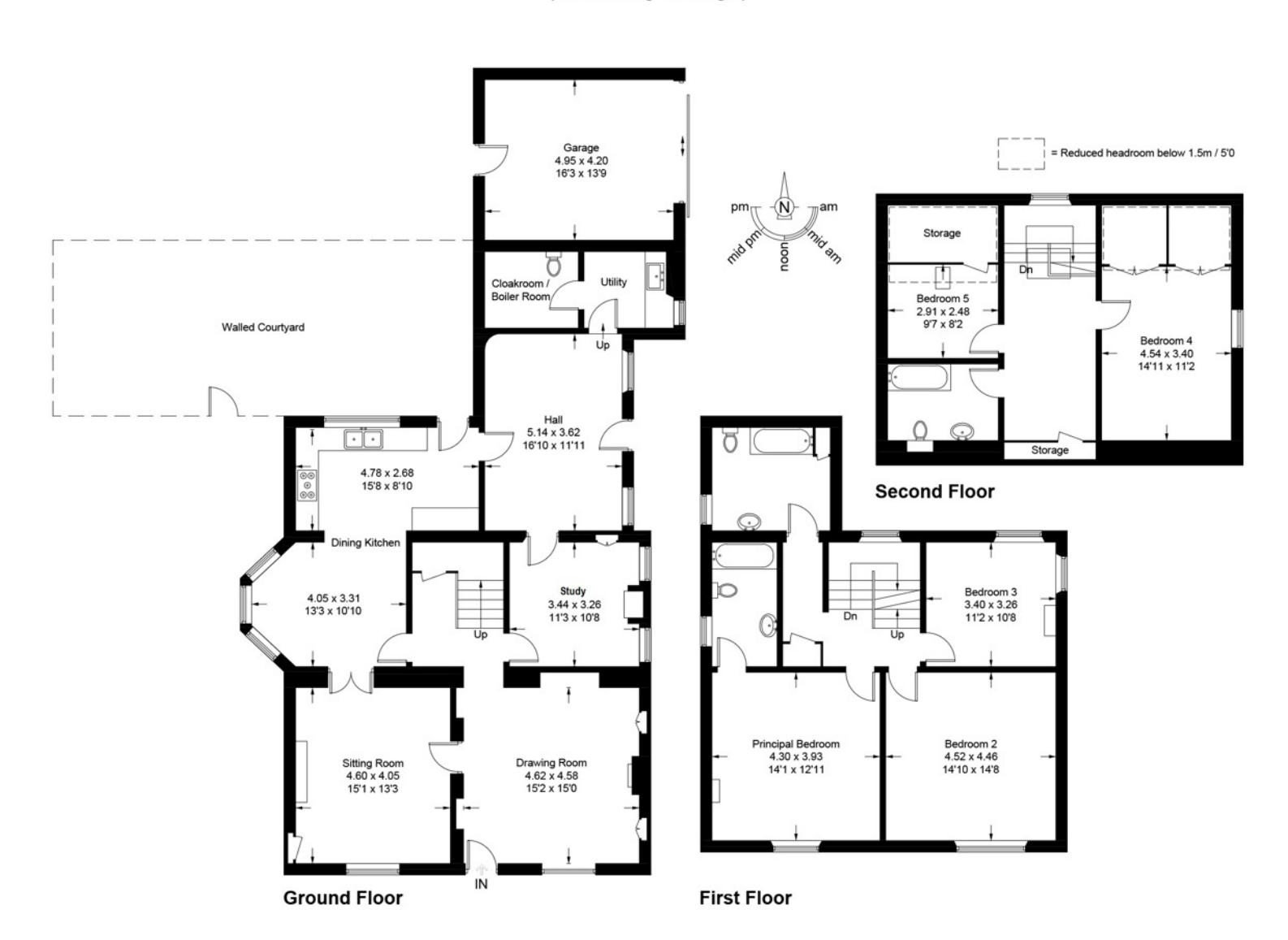
Illustration for identification purposes only, measurements are approximate, not to scale. floorplansUsketch.com © (ID1000033)

Approximate Gross Internal Area = 260.8 sq m / 2807 sq ft (Excluding Garage)