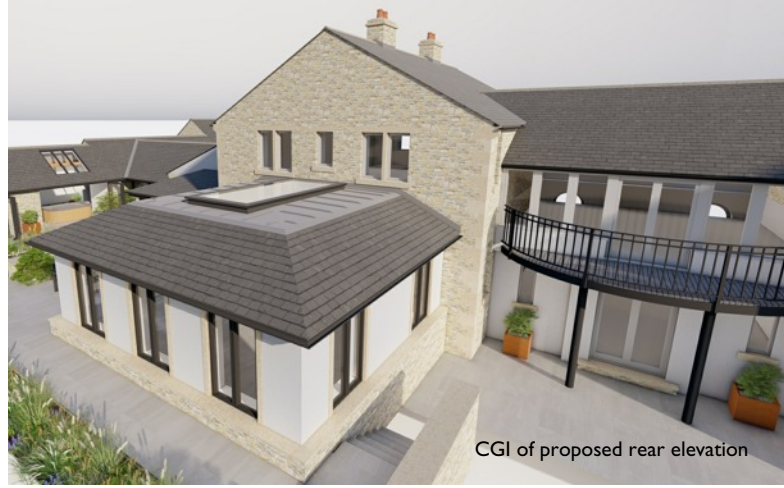
CGI of proposed rear elevation