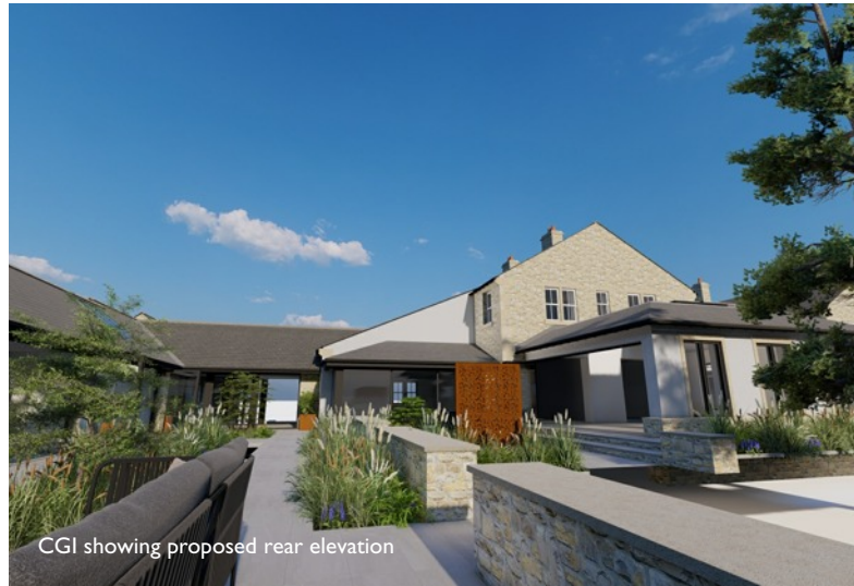
CGI showing proposed rear elevation