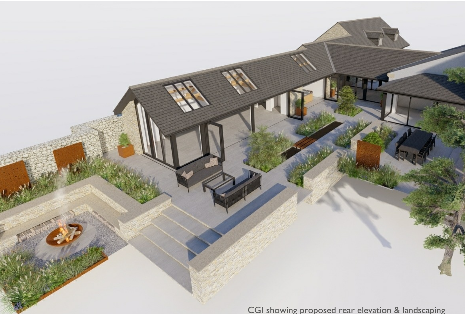
CGI showing proposed rear elevation & landscaping