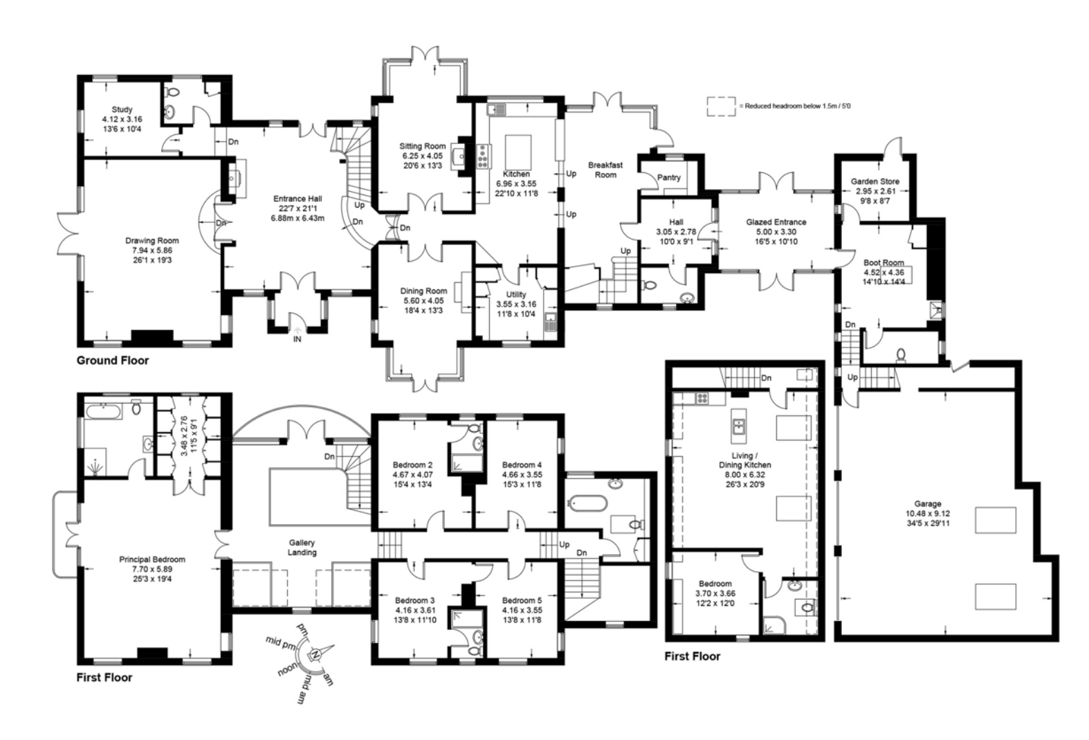
Illustration for identification purposes only, measurements are approximate, not to scale. floorplansUsketch.com © (ID849702)

Approximate Gross Internal Area = 675 sq m / 7266 sq ft (Including Garage / Excluding Void)