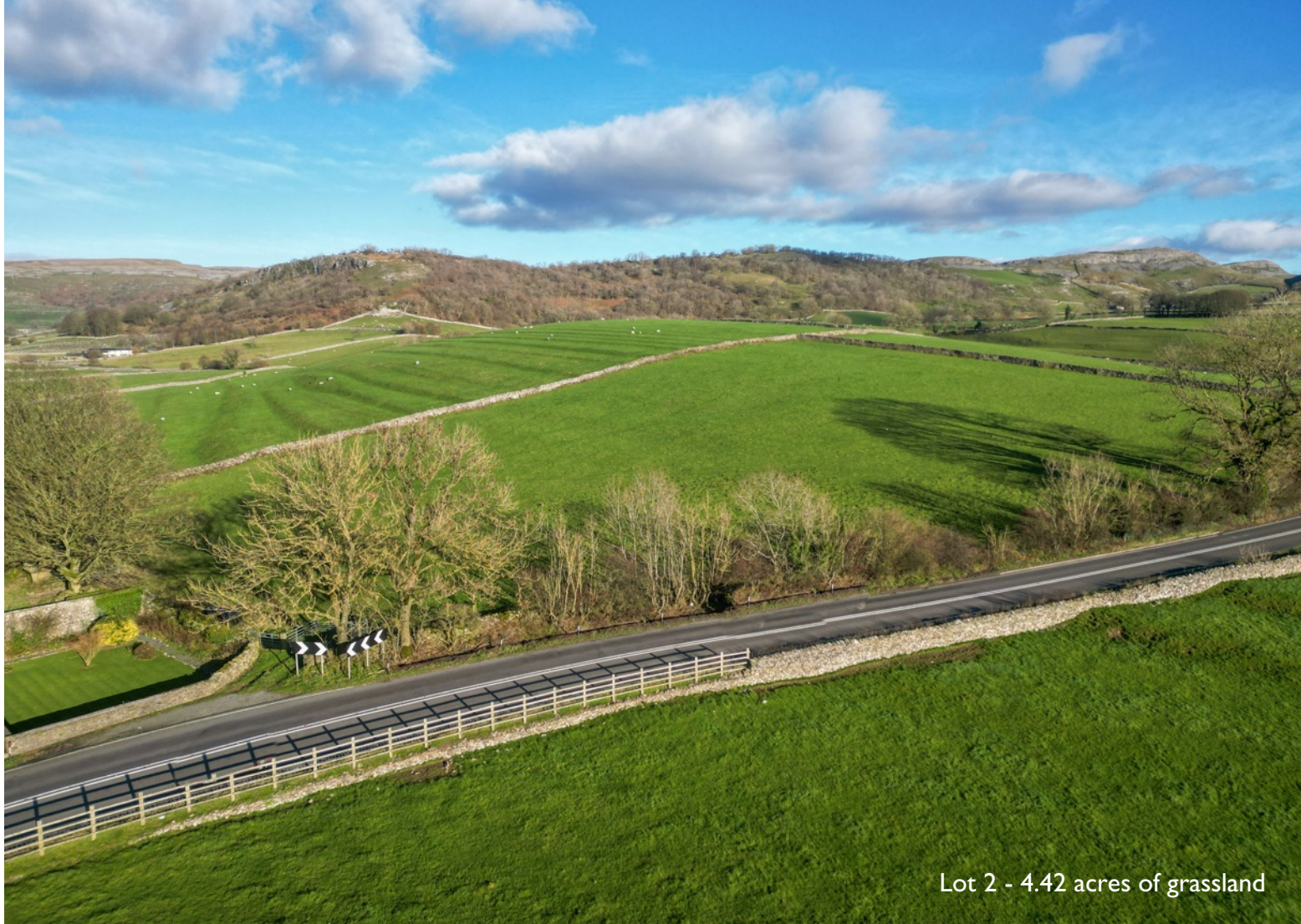
Lot 2 - 4.42 acres of grassland