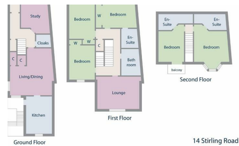
14 Stirling Road Drymen