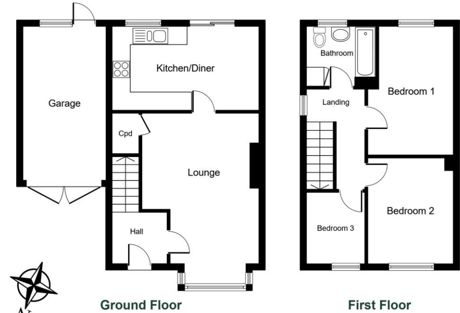
224 Prince Rupert Drive, Tockwith, York, YO26 7PU NOT TO SCALE For layout guidance only Total floor area 92.4 sq.m. (995 sq.ft.) Approx (Including Garage)

Renton & Parr Ltd for themselves and for the Vendors or lessors of this property whose agents they give notice that :-