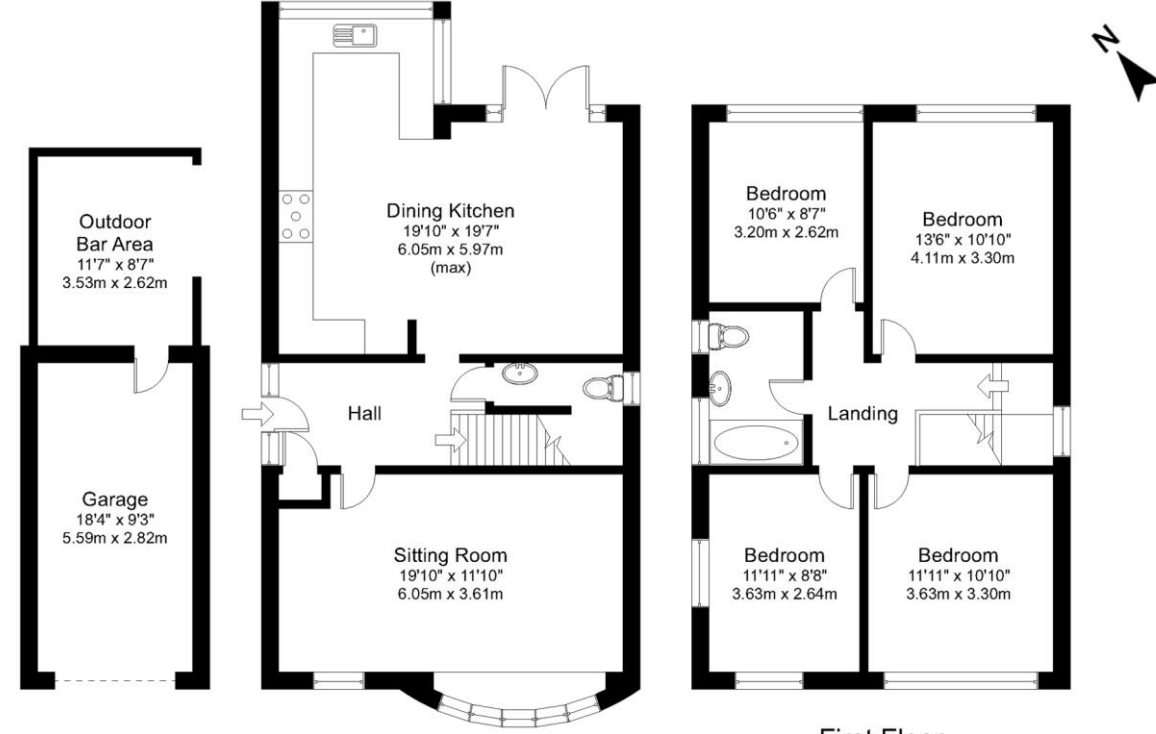
Ground Floor Gross internal floor area excluding Garage & Outdoor Bar Area (approx.): 123.9 sq m (1,334 sq ft) Not to Scale. Copyright © Apex Plans. For illustrative purposes only